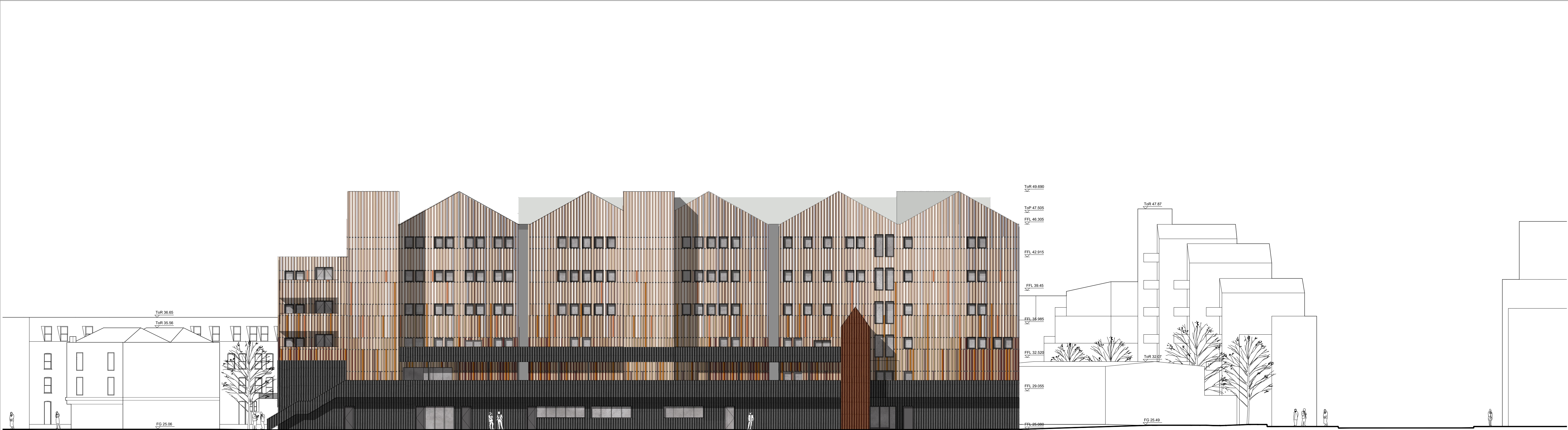
Cobourg Street The Exmouth Arms Proposed Site Multiuse Hall Hampstead Road 03 North Elevation C 1:200@A1