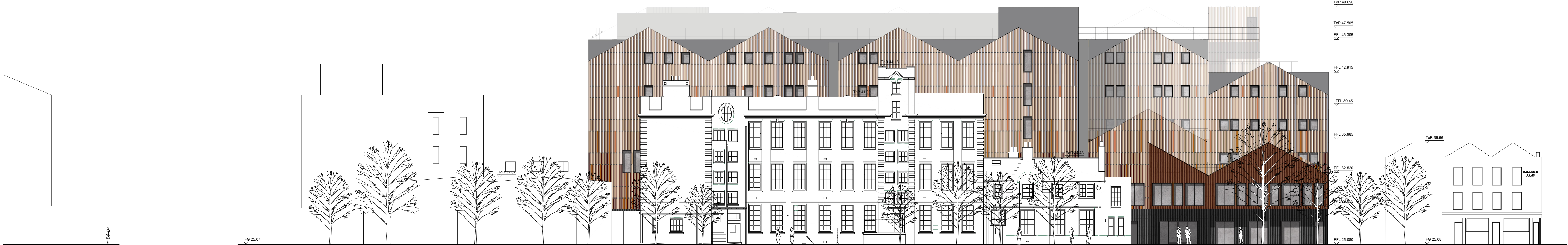
Hampstead Road Multiuse Hall Managed Workspace Proposed Site The Exmouth Arms 04 South Elevation D 1:200@A1