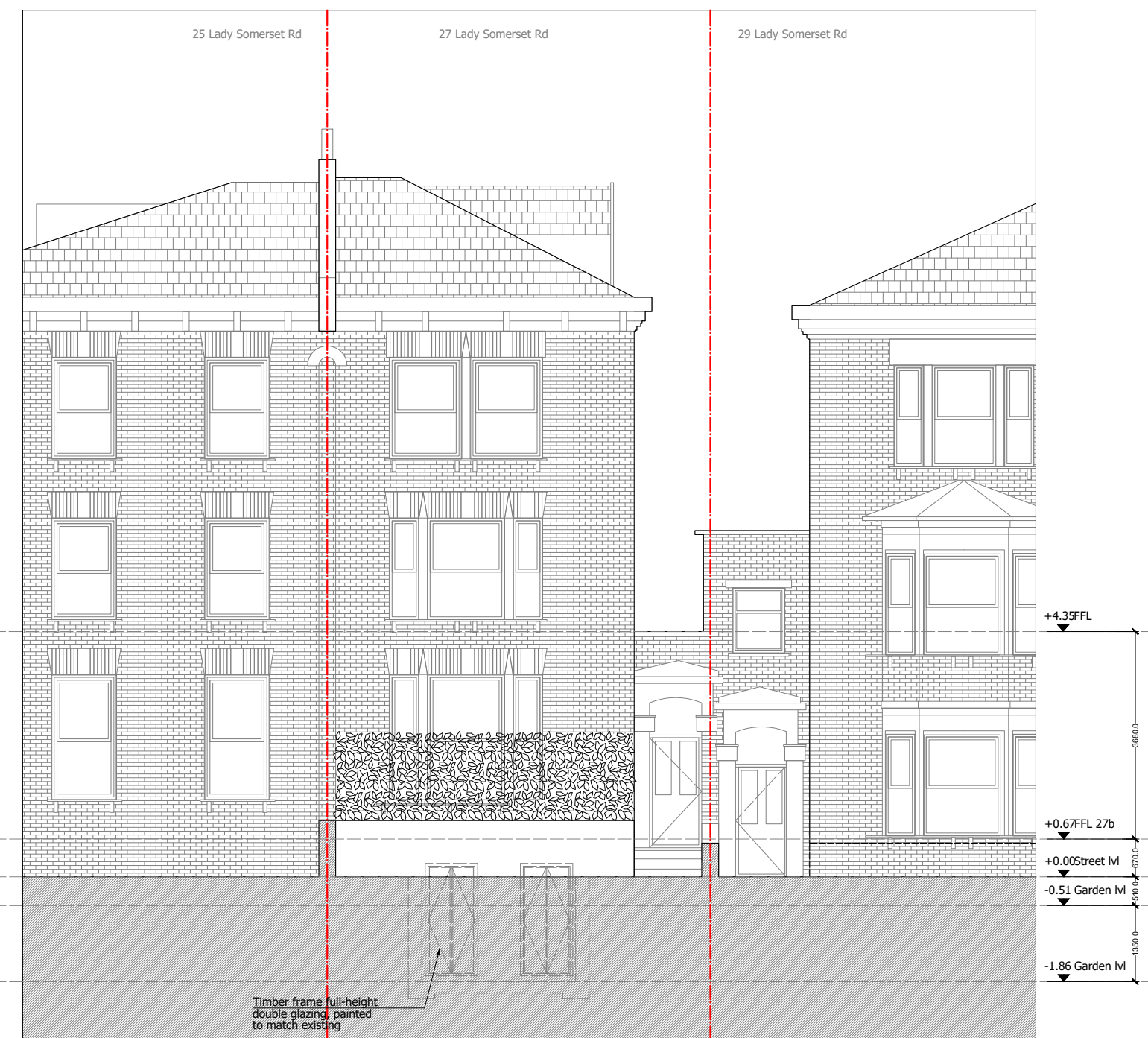
02. Proposed Front elevation