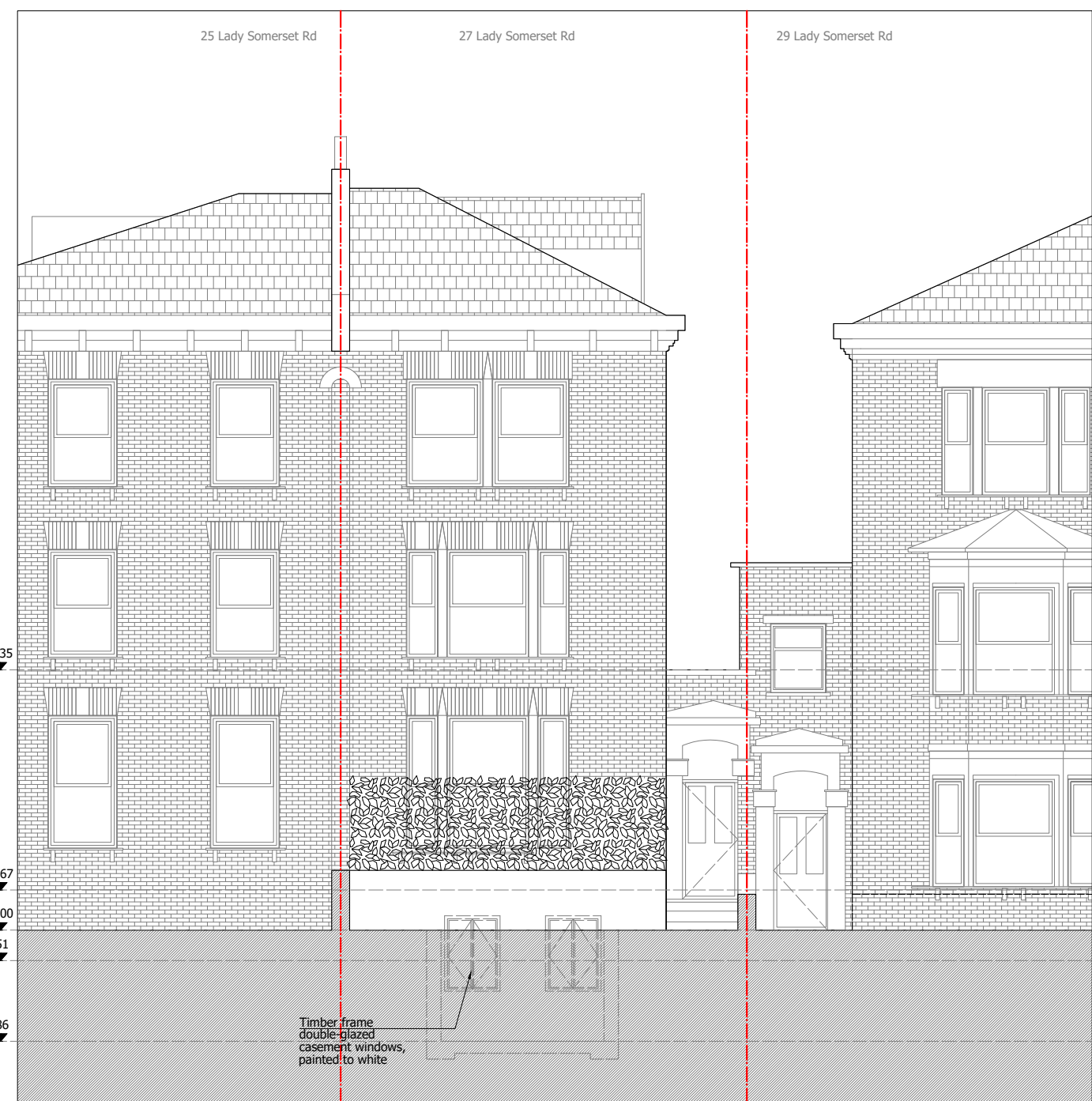
01. Current Front elevation