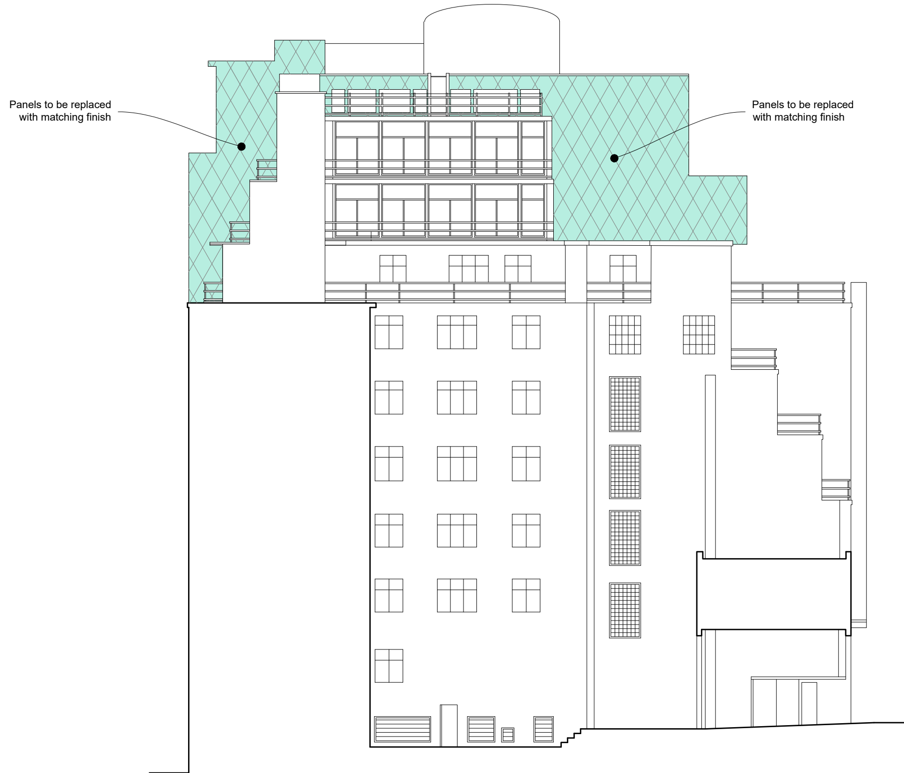
1 Proposed North Elevation scale 1:200