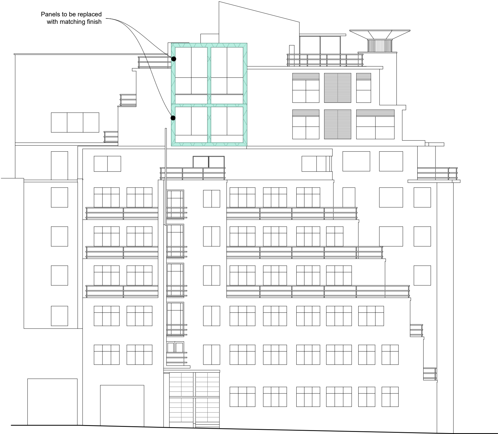
1 Proposed West Elevation scale 1:200