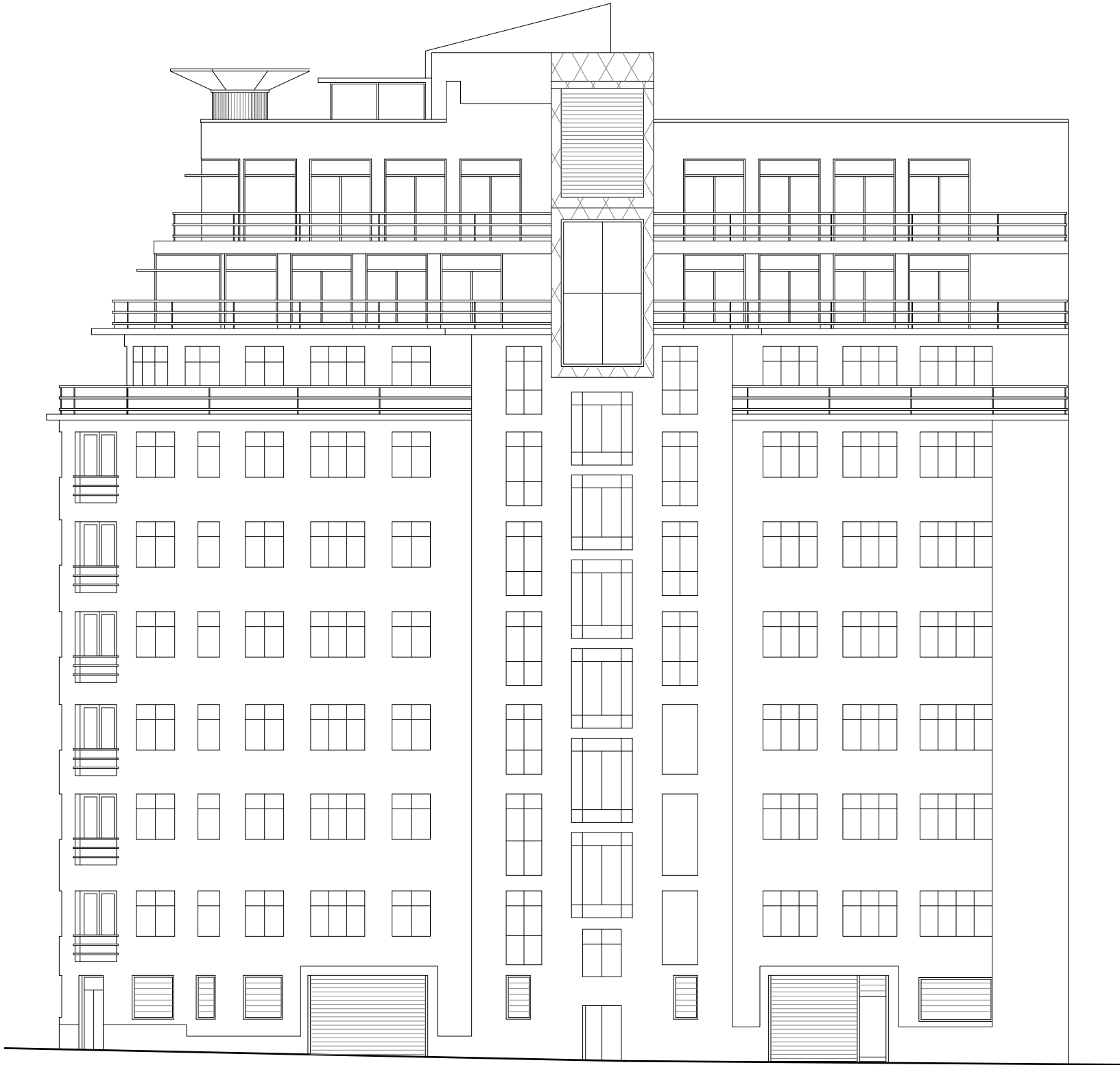
1 Existing East Elevation scale 1:200