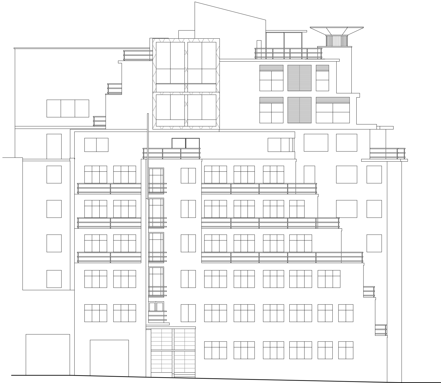
1 Existing West Elevation scale 1:200