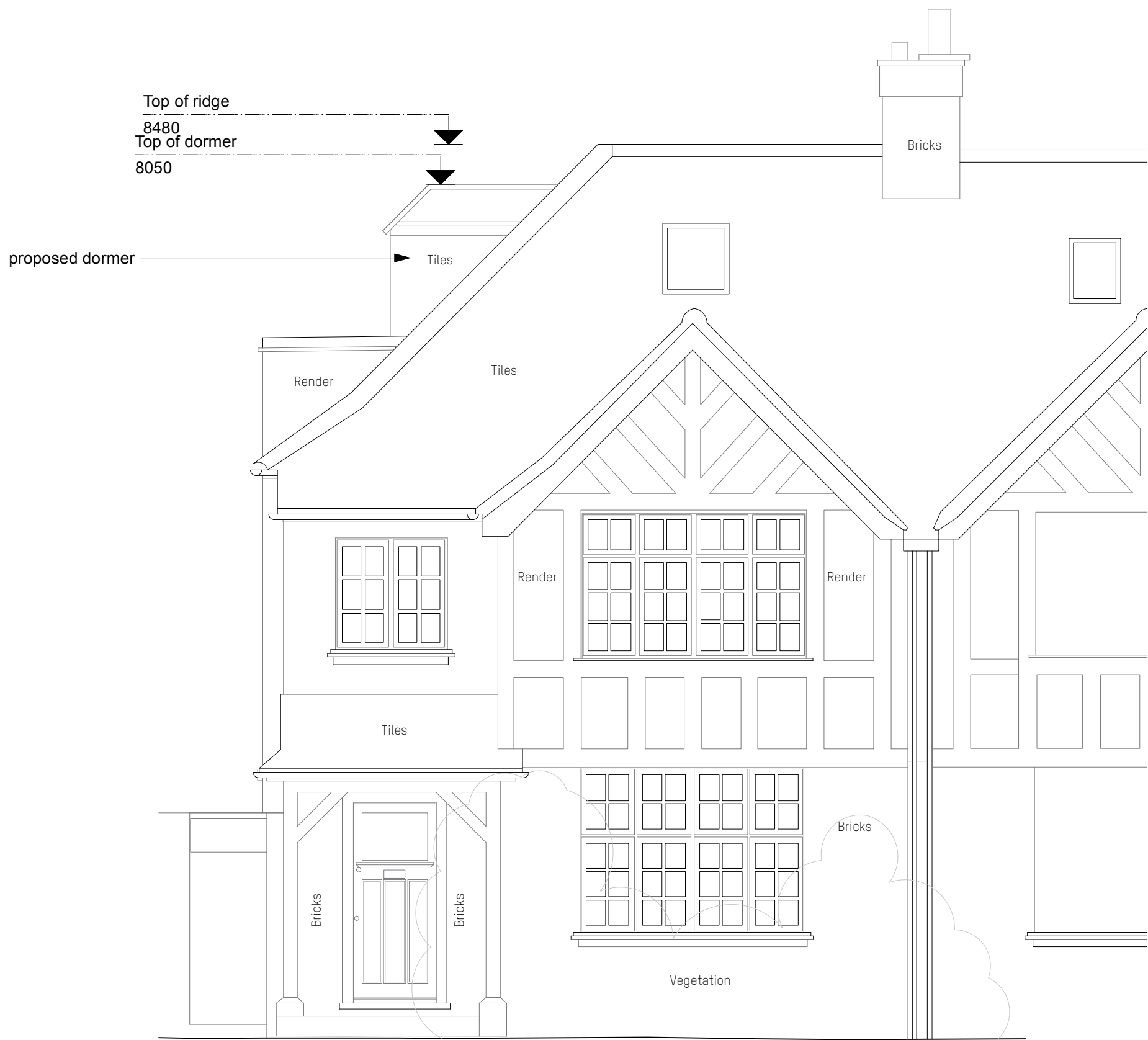
2 Proposed Front Elevation P-300/ Scale: 1:50