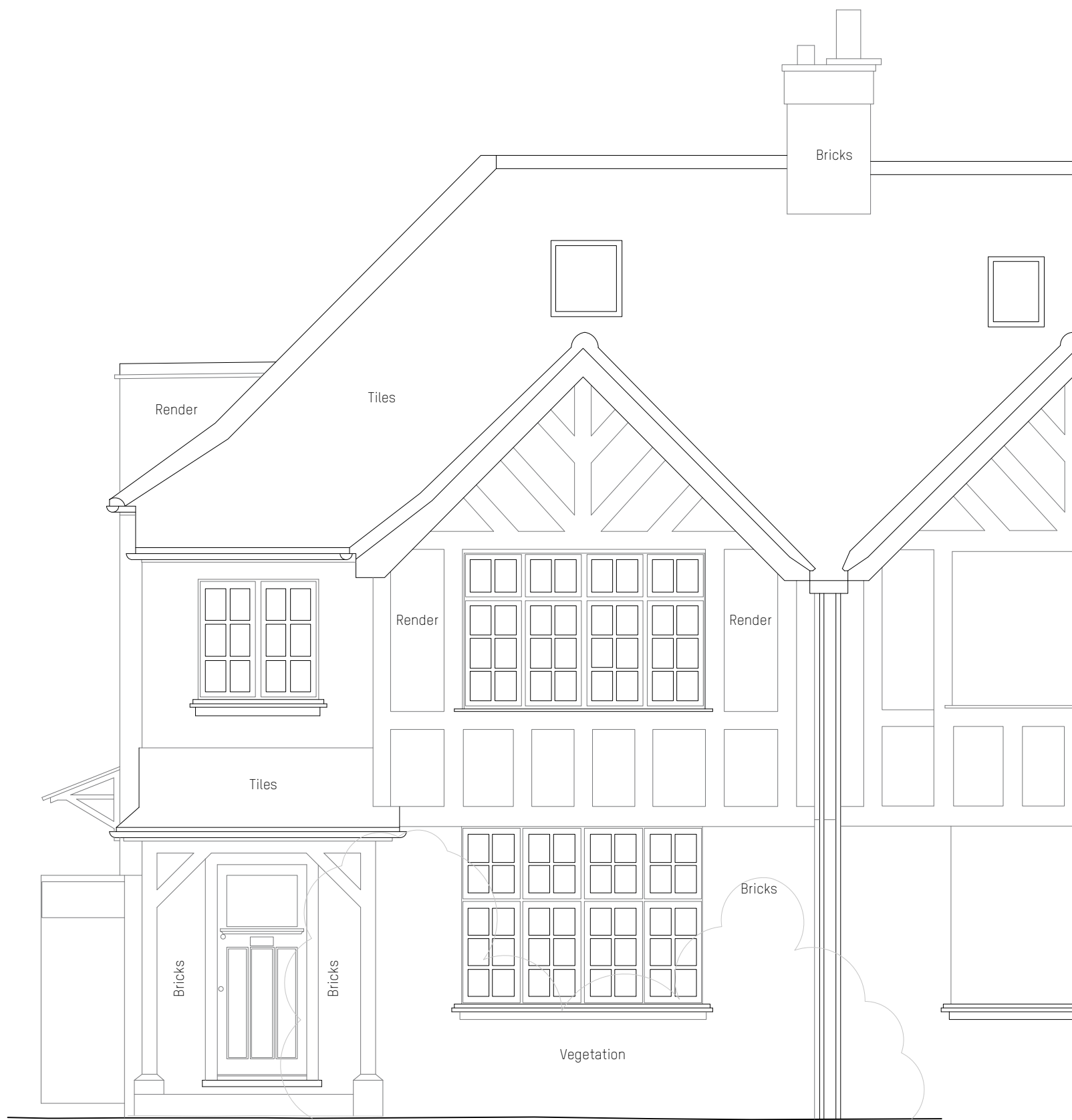
1 Existing Front Elevation P-300/ Scale: 1:50