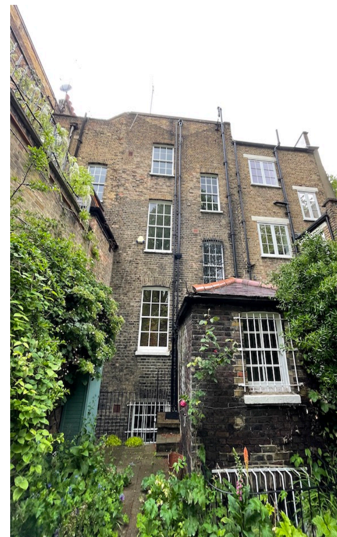
REAR ELEVATION to private garden & St George's Gardens

PROPOSALS remove existing wvp and install new cast iron svp to serve new Bathroom 1F-03 install new air bricks to serve bathroom extracts from new bathroom 1F-03 and existing Bathroom BF-06