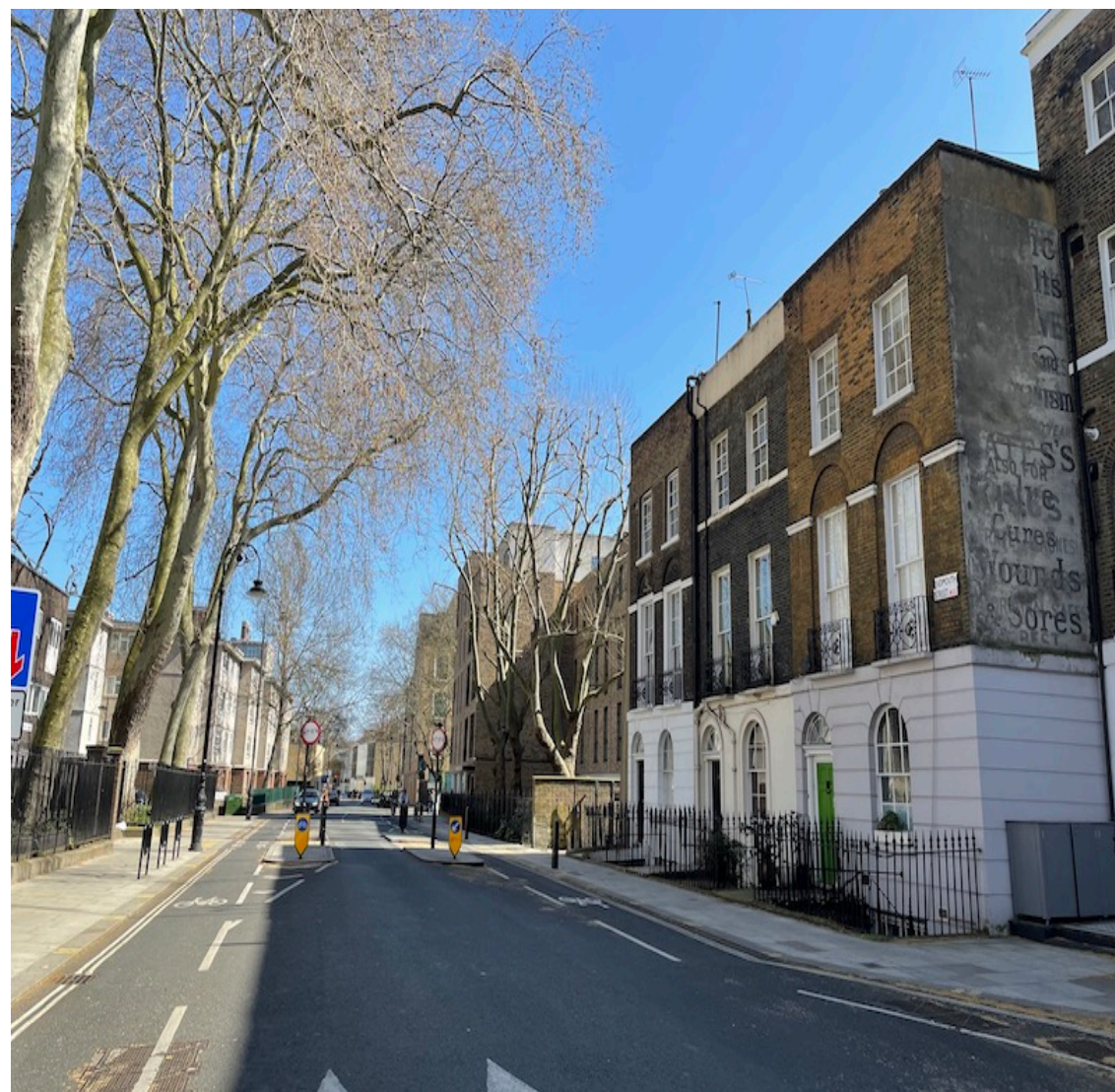
FRONT ELEVATION in context

PROPOSALS remove all existing cast iron pipework from front elevation please refer to drawing A3-16: Elevations as Proposed