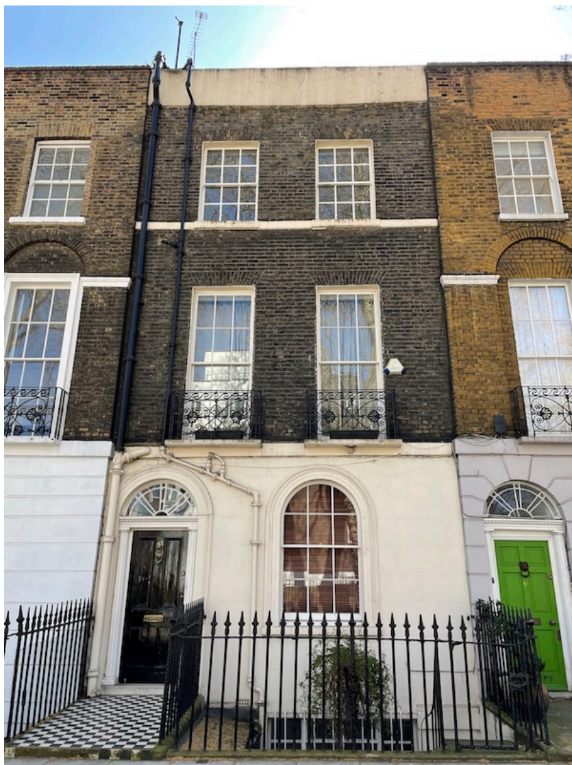
FRONT ELEVATION to Sidmouth Street

PROPOSALS remove all existing cast iron pipework from front elevation please refer to drawing A3-16: Elevations as Proposed