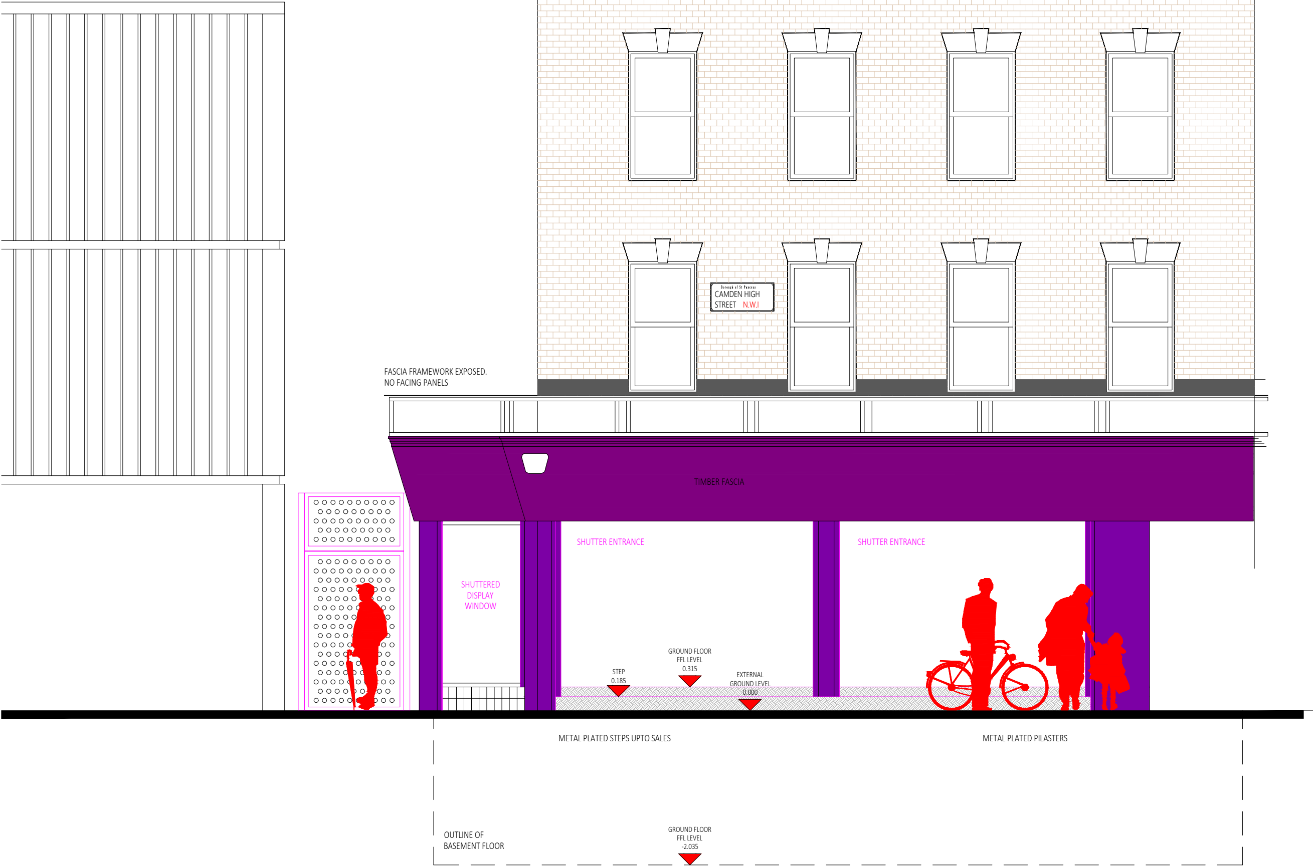
Shopfront - as existing scale - 1:25 @ A1 / 1:50 @ A3

ALL DIMENSIONS TO BE CONFIRMED AT STRIP OUT SURVEY