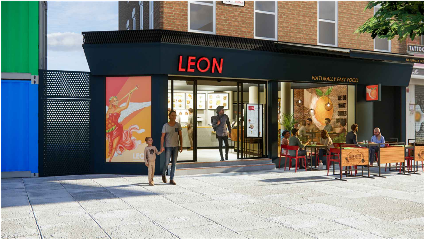
Shopfront VISUALS - as proposed Left hand side view NTS