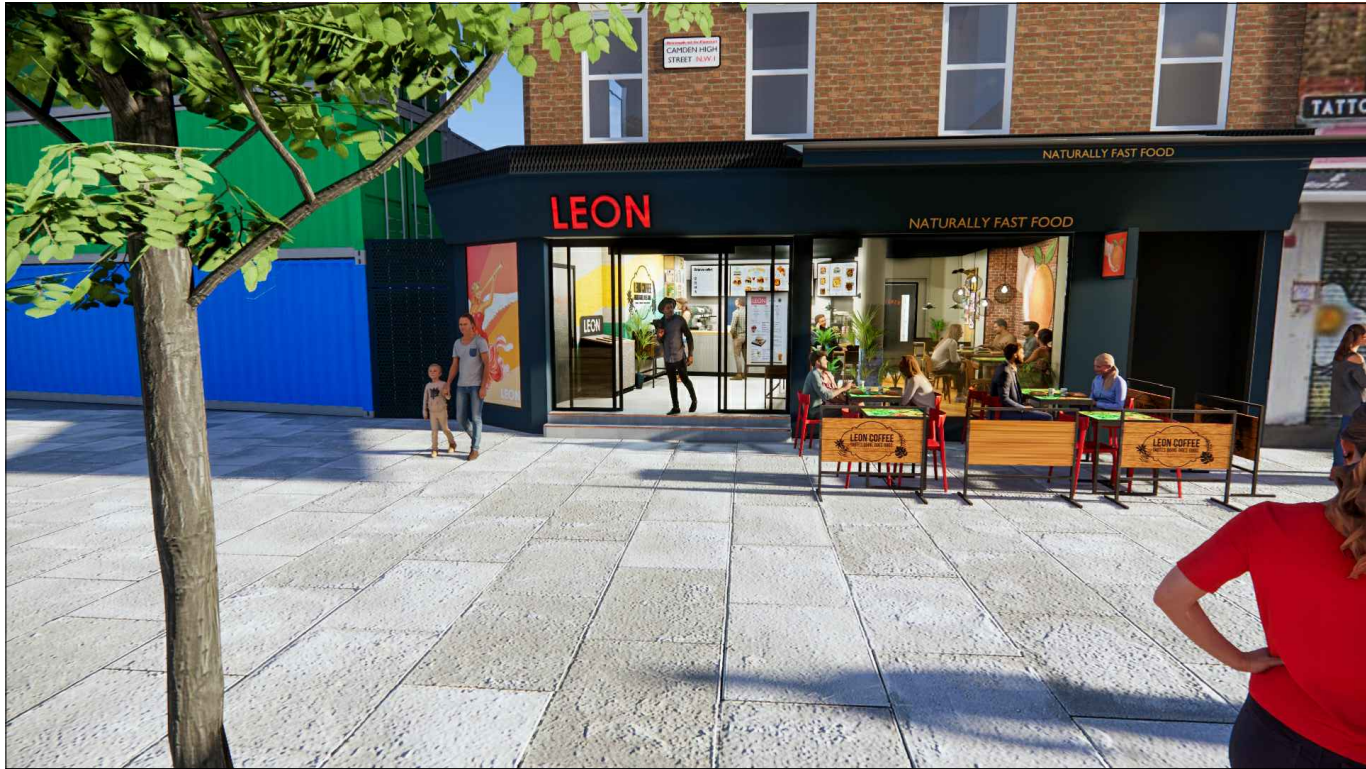
Shopfront VISUALS - as proposed Front view NTS