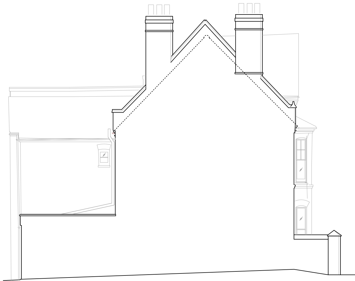
Existing Side Elevation Scale: 1:100