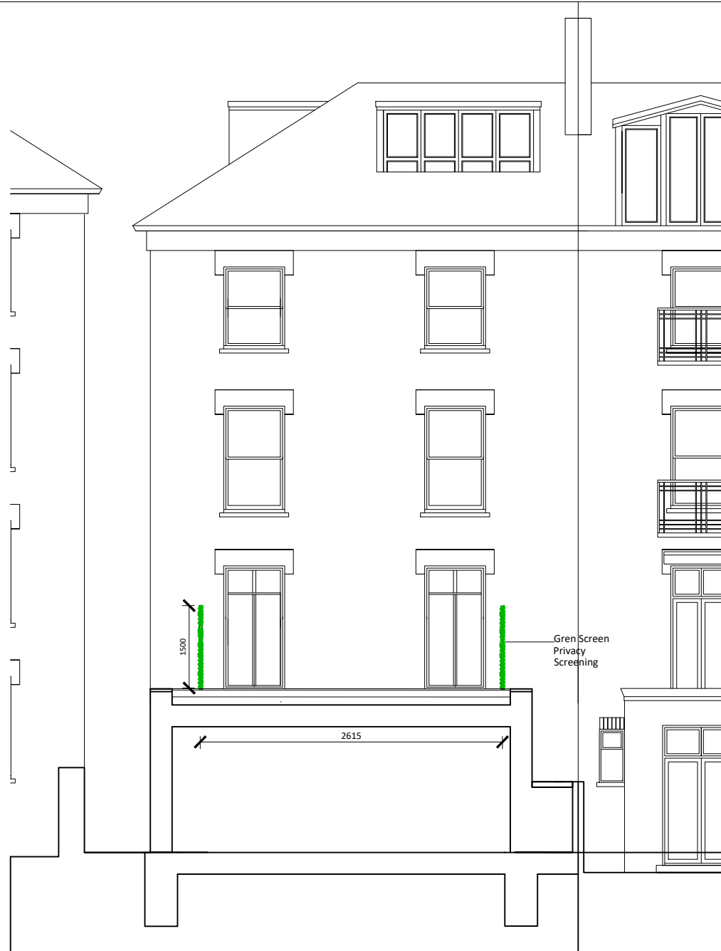
Proposed Option B A-A Section