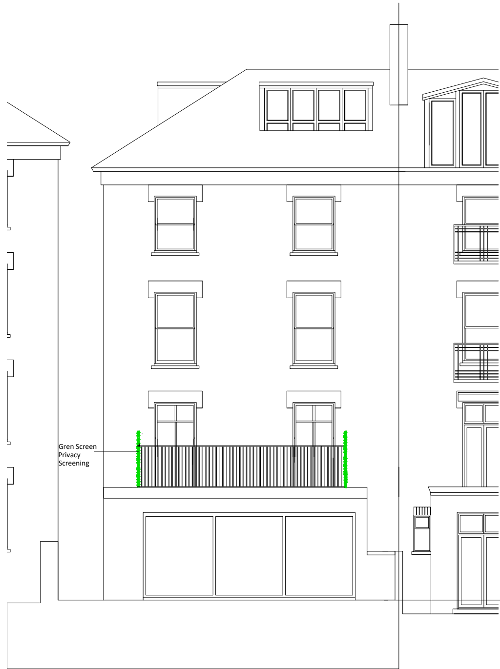
Proposed Option B South Elevation