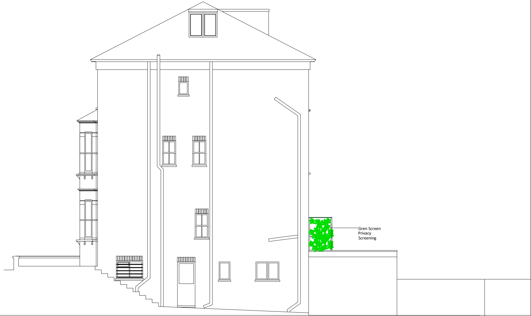
Proposed Option B West Elevation