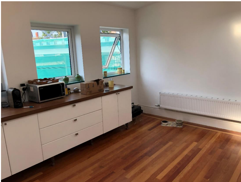
Photo 2: Rear window beside the steel beam outside the first floor kitchen and dining area