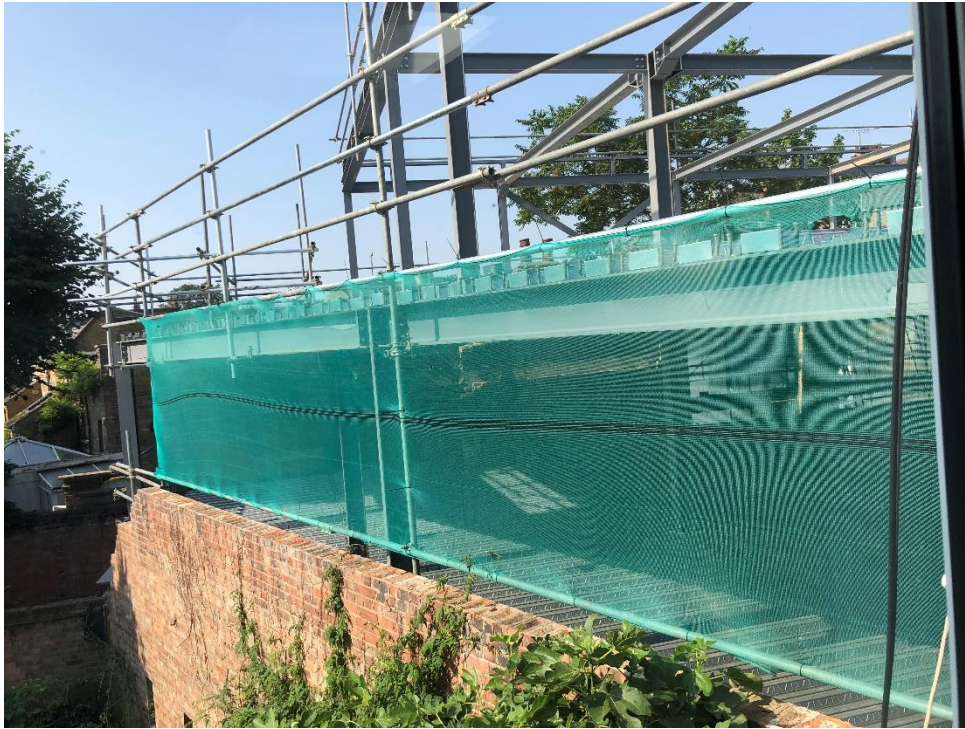
Photo 3: East Wall looking south from the first floor kitchen window