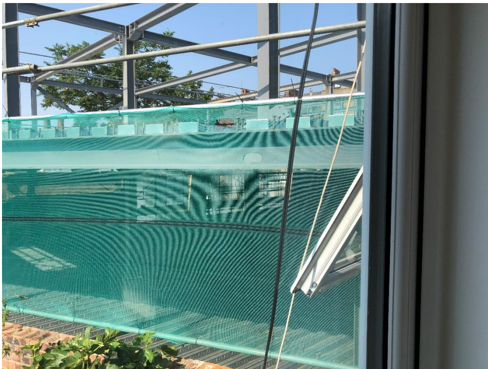
Photo 4: East Wall looking south from another first floor kitchen window