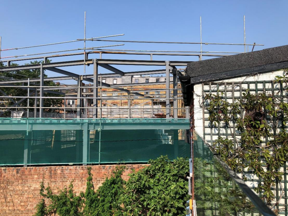
Photo 5: East wall (under construction) looking west from the roof terrace