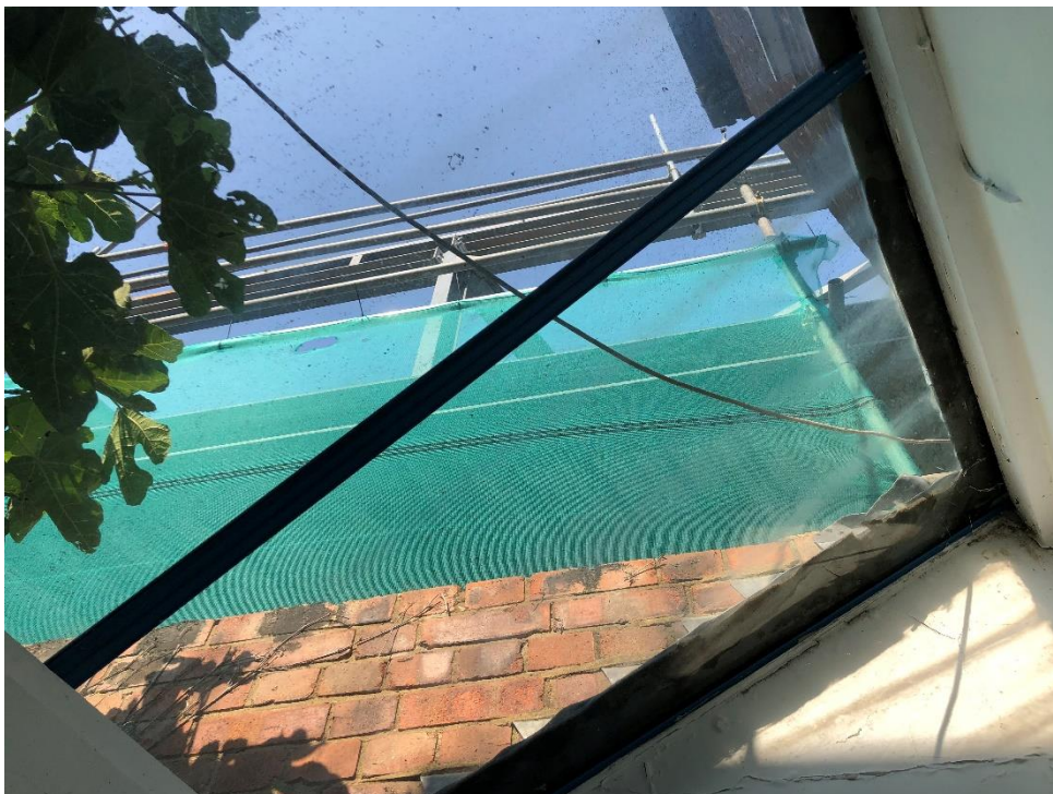
Photo 8: Glass roof at the rear ground floor bedroom ('main bedroom')