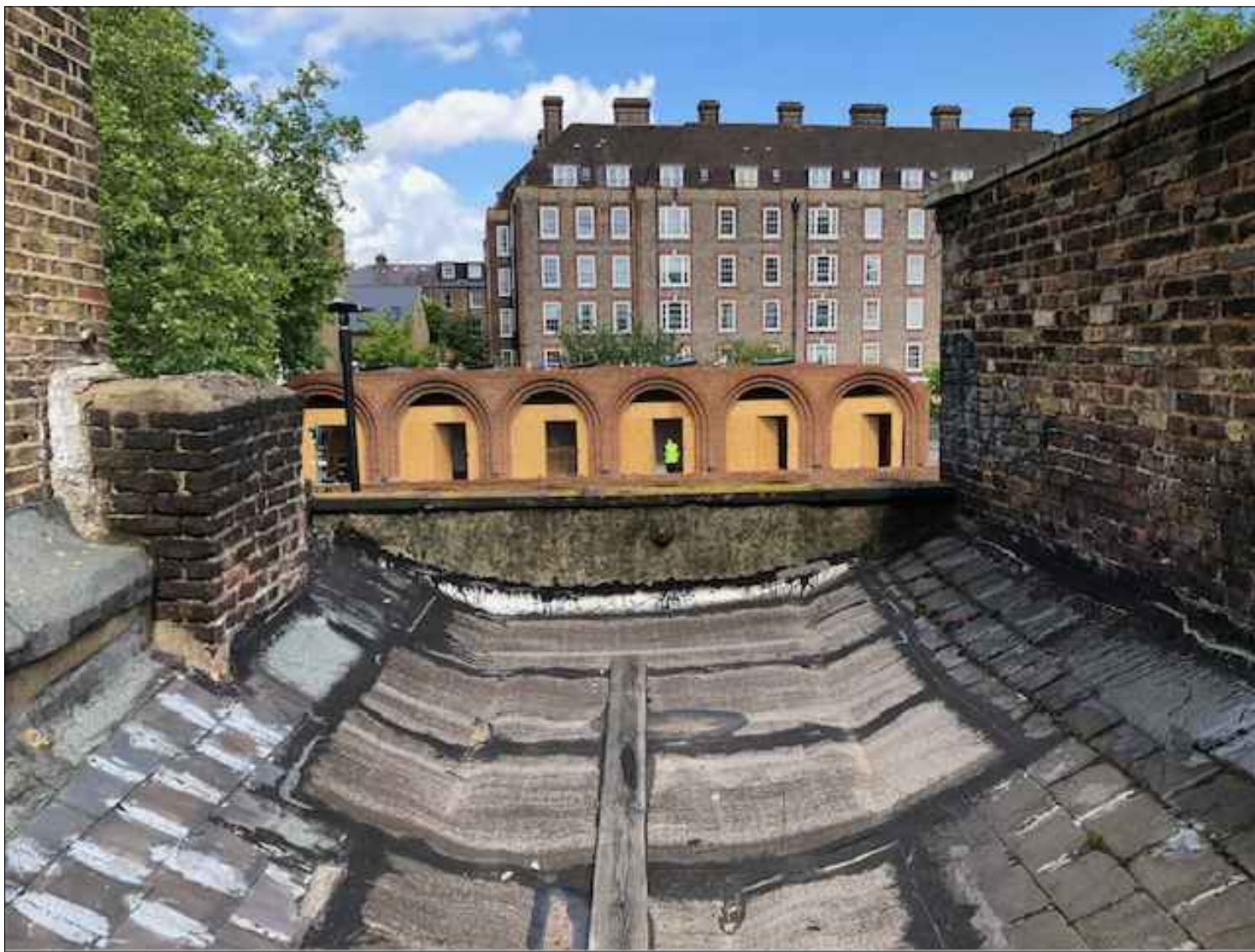
LEAKING WEAK ROOF STRUCTURE