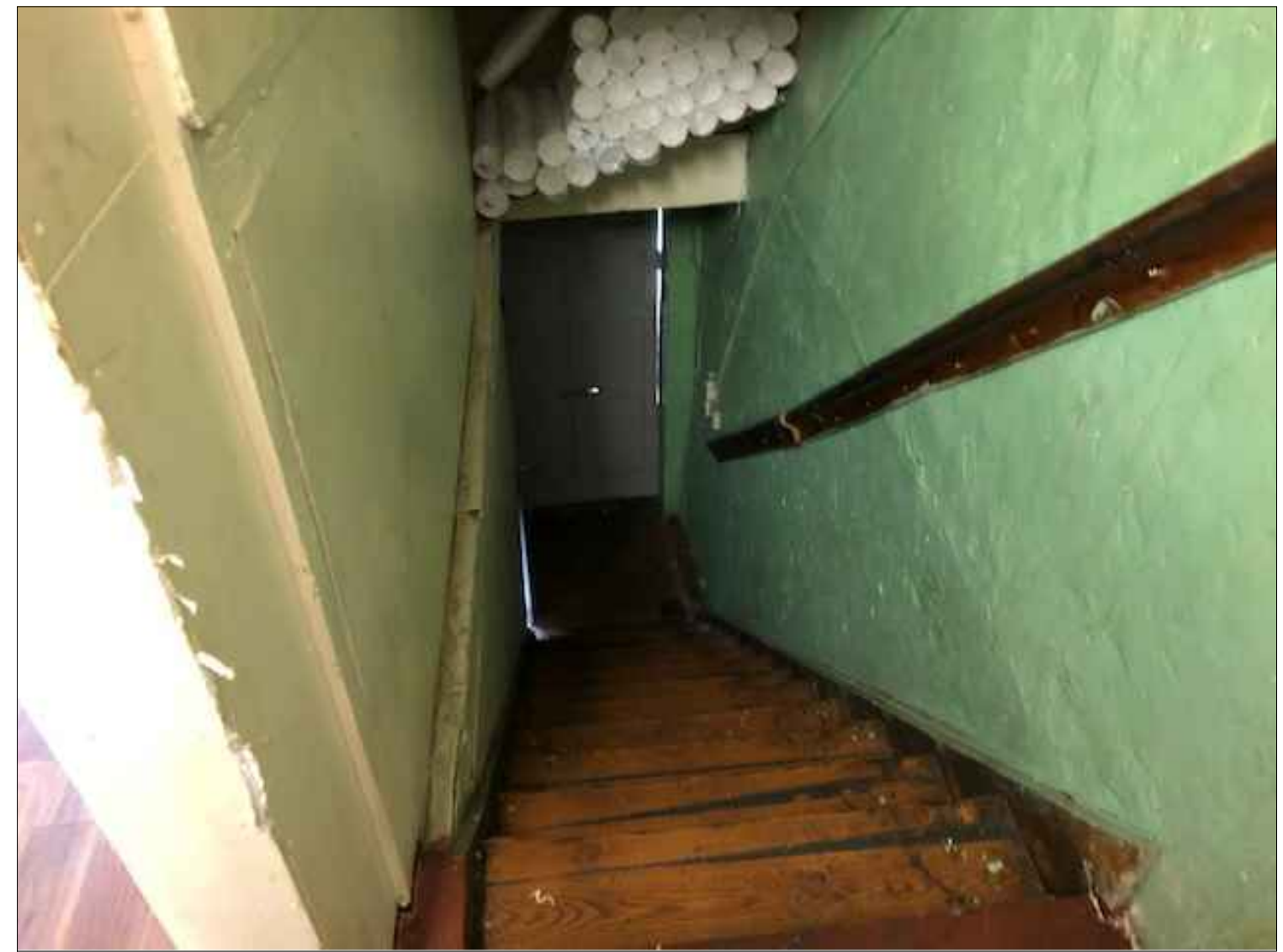
LOOSE TIMBER STAIRS