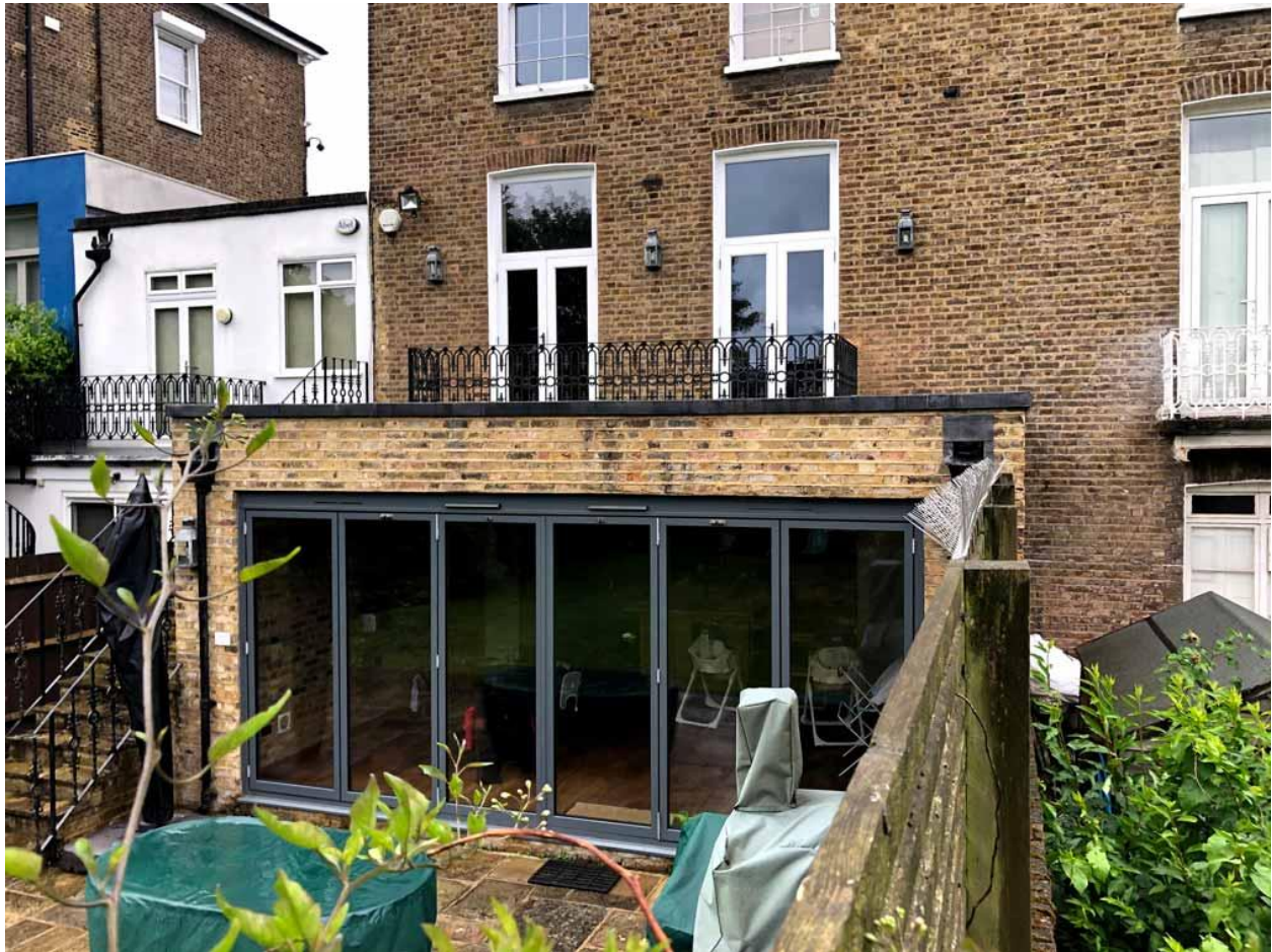
Existing rear of No 40 Parkhill Road