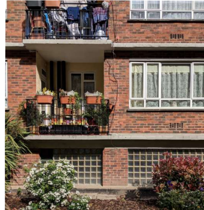
Blemundsbury Facade Photograph