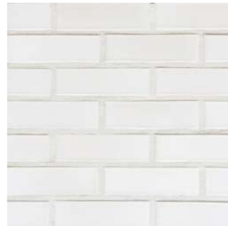
Proposed white glazed brick