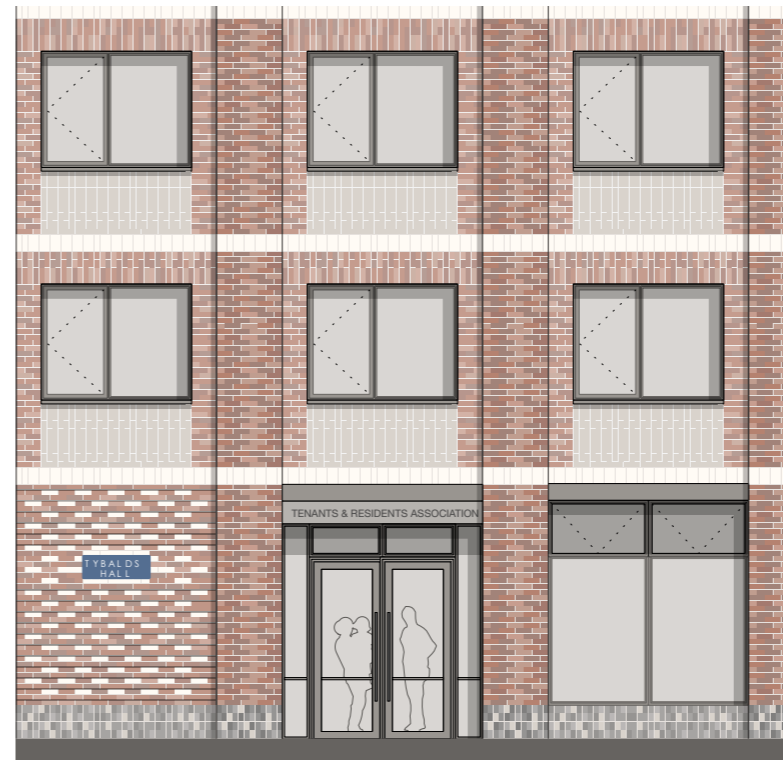
Block C North elevation bay