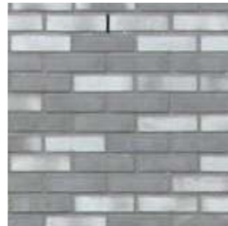
Proposed green glazed bricks