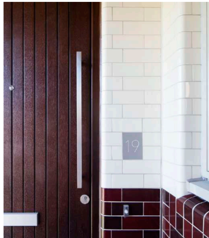
Precedent - Bourne Estate