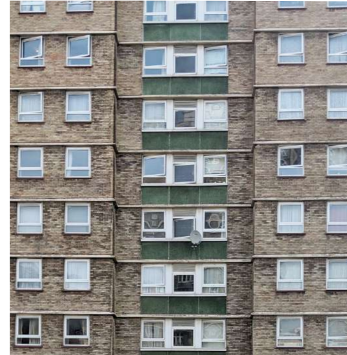
Chancellors Facade Photograph