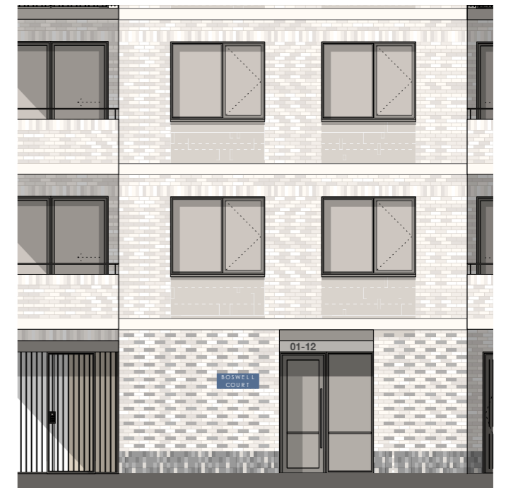
Block D elevation