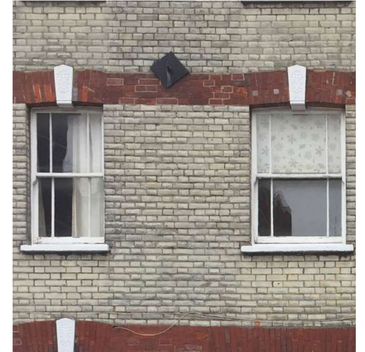
Orde Hall Street Facade Photograph