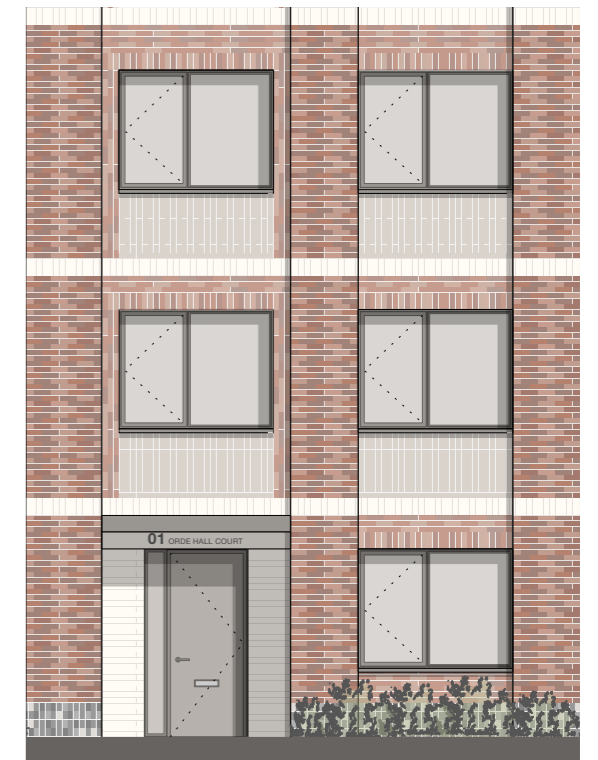
Block B North elevation bay