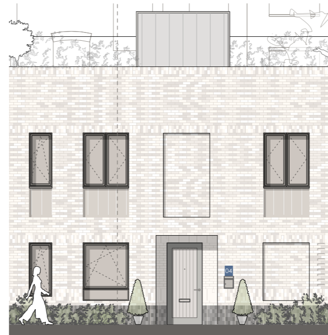
Mews elevation bay