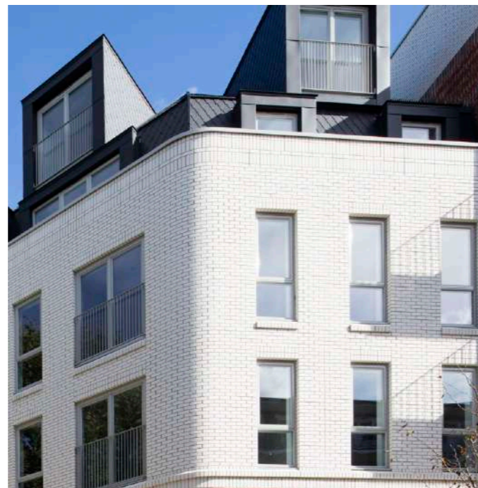
Precedent - Bourne Estate