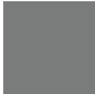
Proposed metalwork colour