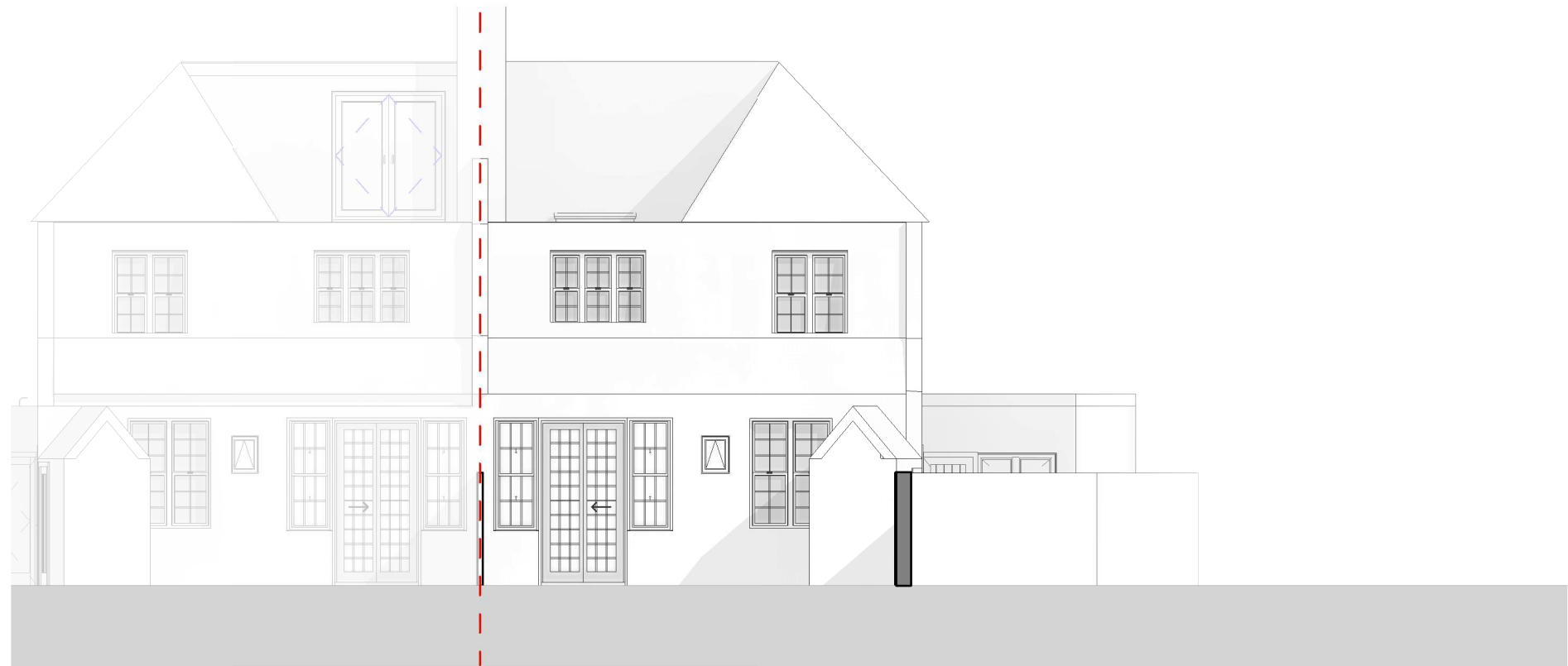
① Existing Rear Elevation 1 : 100