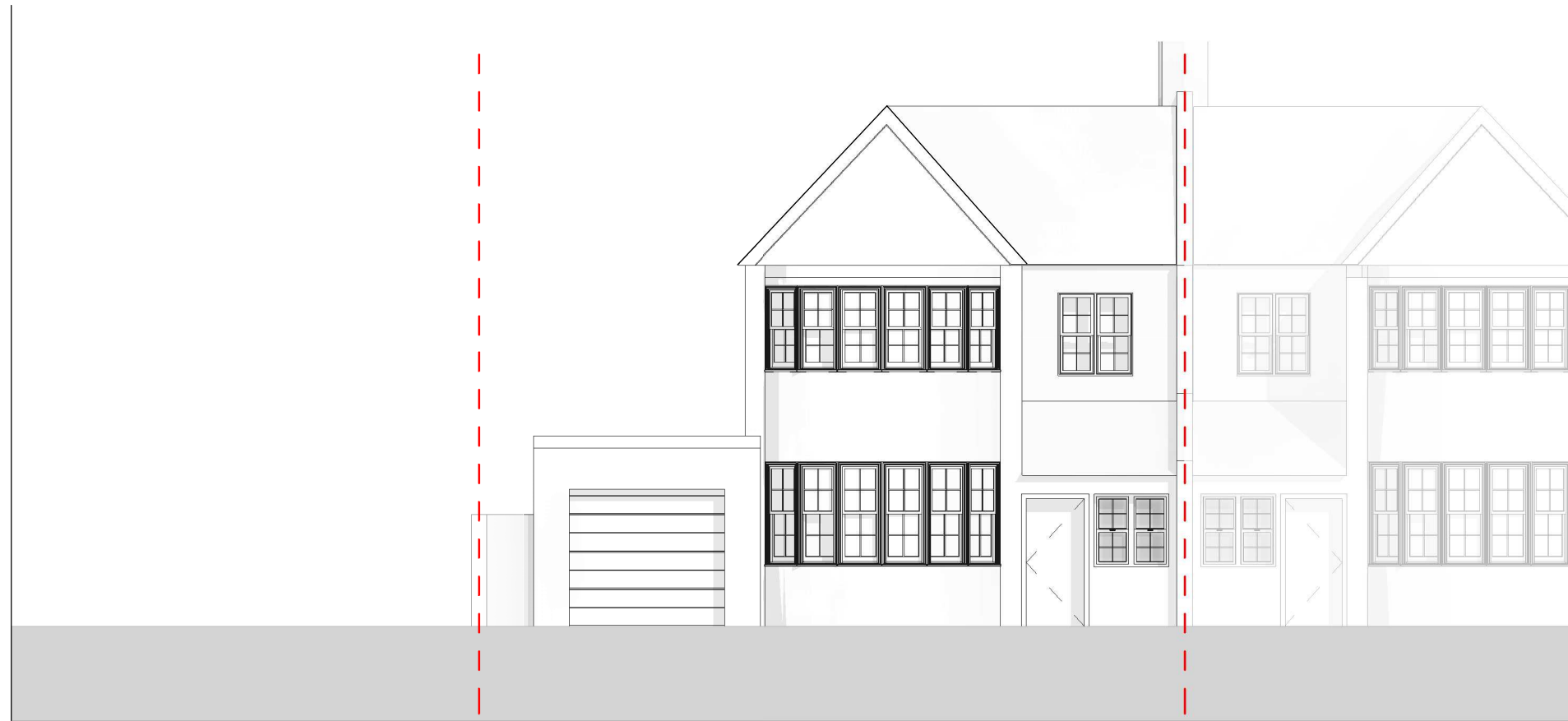
② Existing Front Elevation 1 : 100