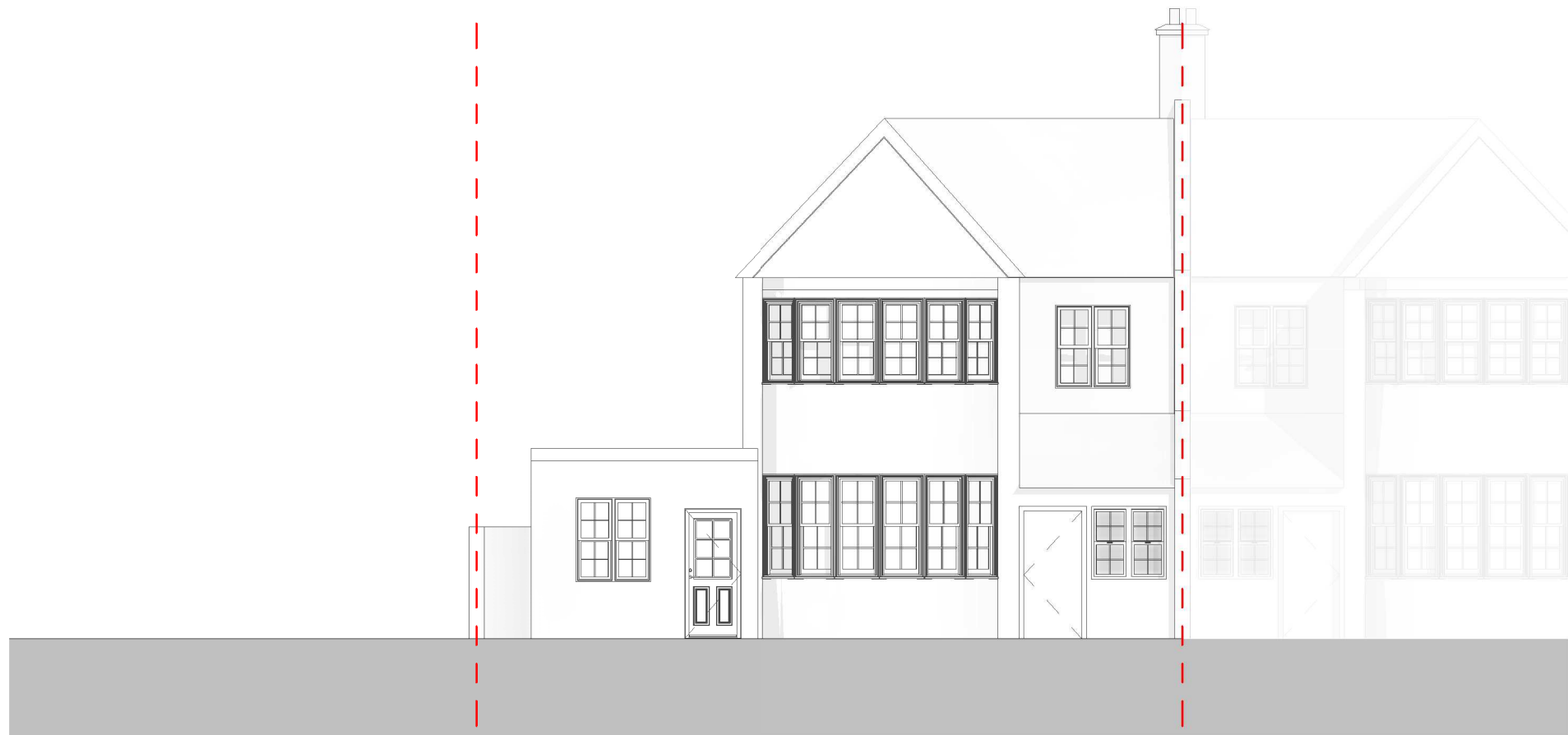
④ Proposed Front Elevation 1 : 100