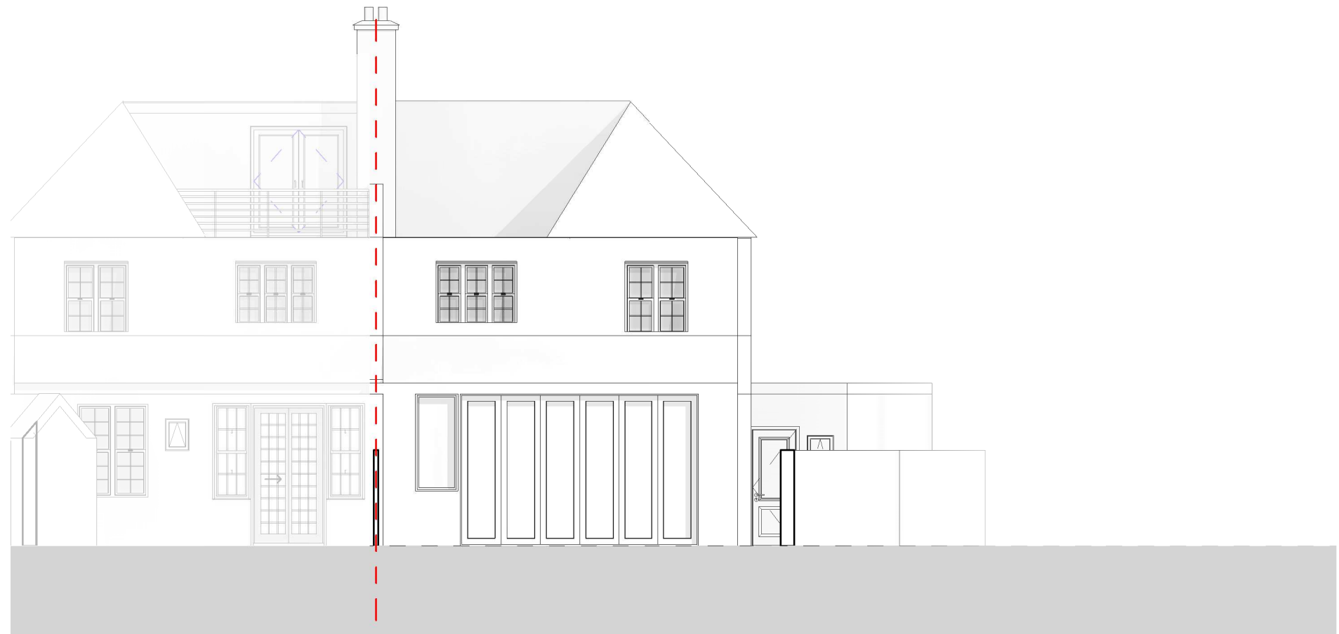
② Proposed Rear Elevation 1 : 100

Notes: Contractors are responsible for the verification of all dimensions on site and the architect is to be informed of any discrepancy. Do not scale from this drawing. All Dimensions to be checked on Site