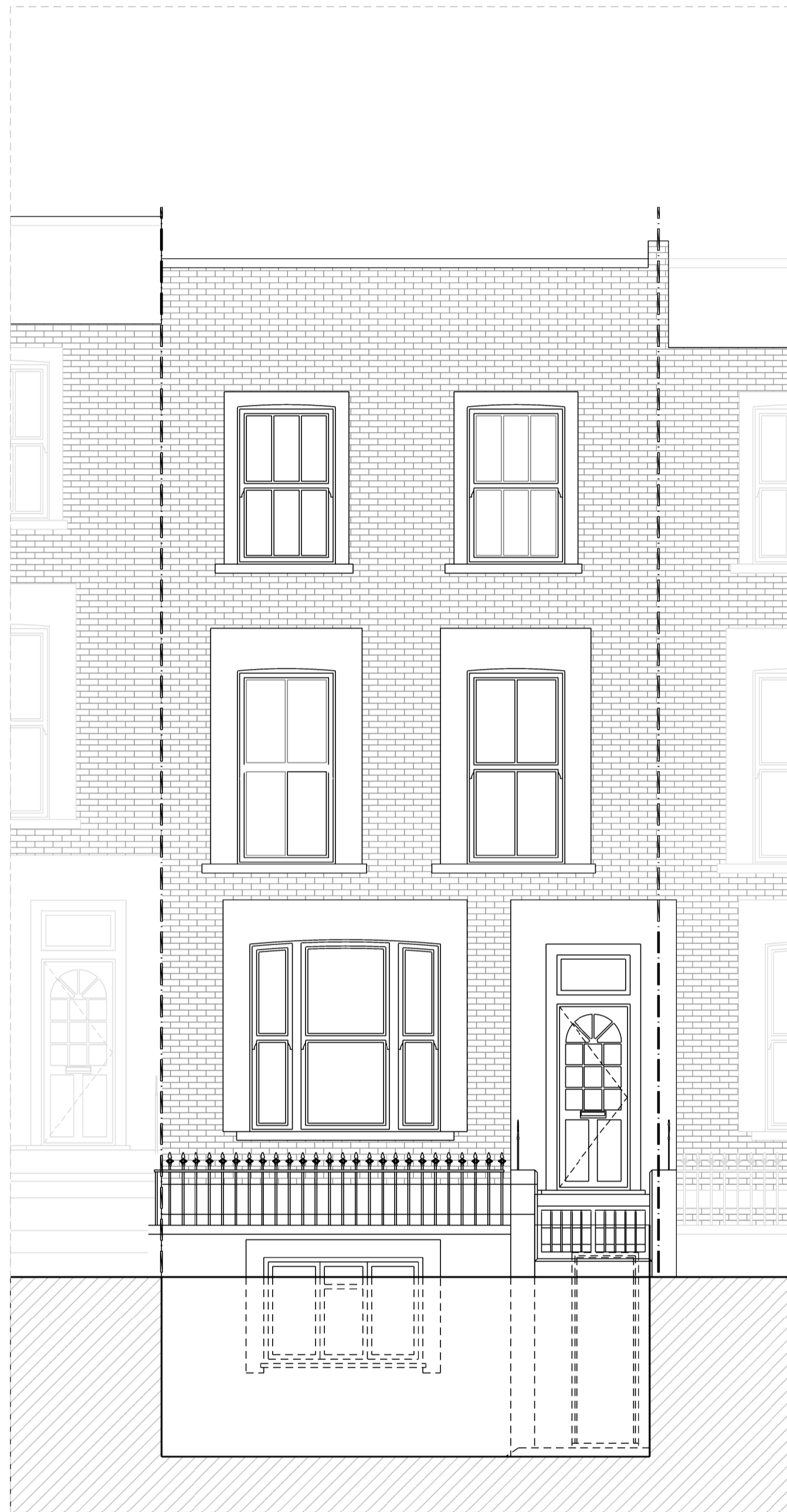
01 FRONT ELEVATION SCALE 1:50 @ A1