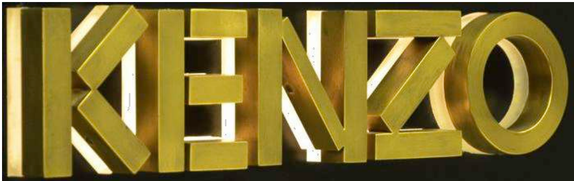
EXAMPLE OF LETTERING, MOUNTED ONTO A GLOWING BACK LIT OPAL ACRYLIC