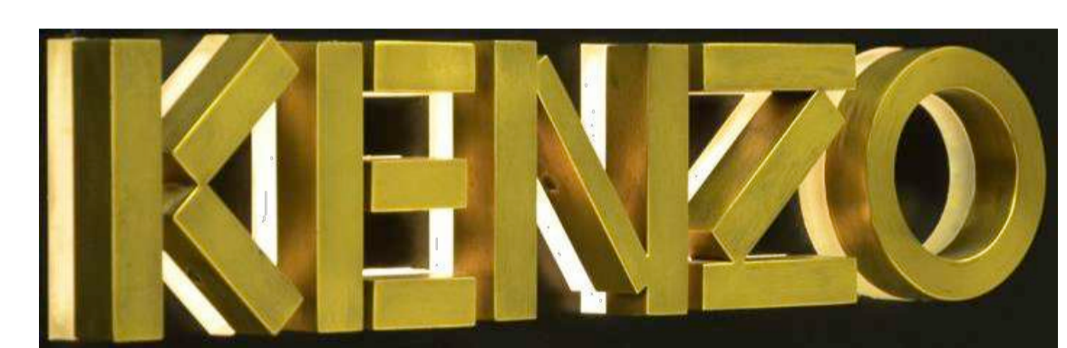
EXAMPLE OF LETTERING, MOUNTED ONTO A GLOWING BACK LIT OPAL ACRYLIC