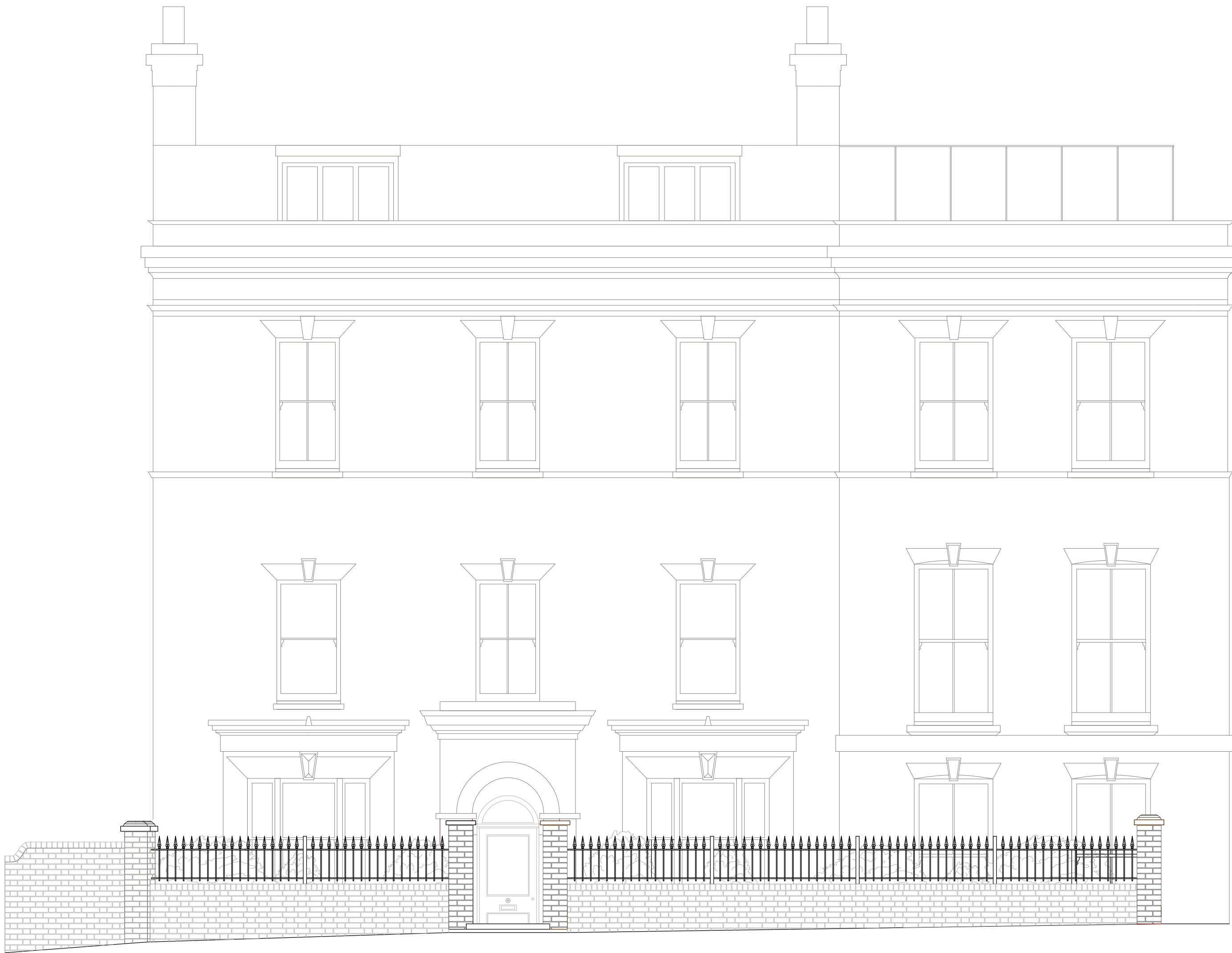
1 Existing Front Gate Scale: 1:50