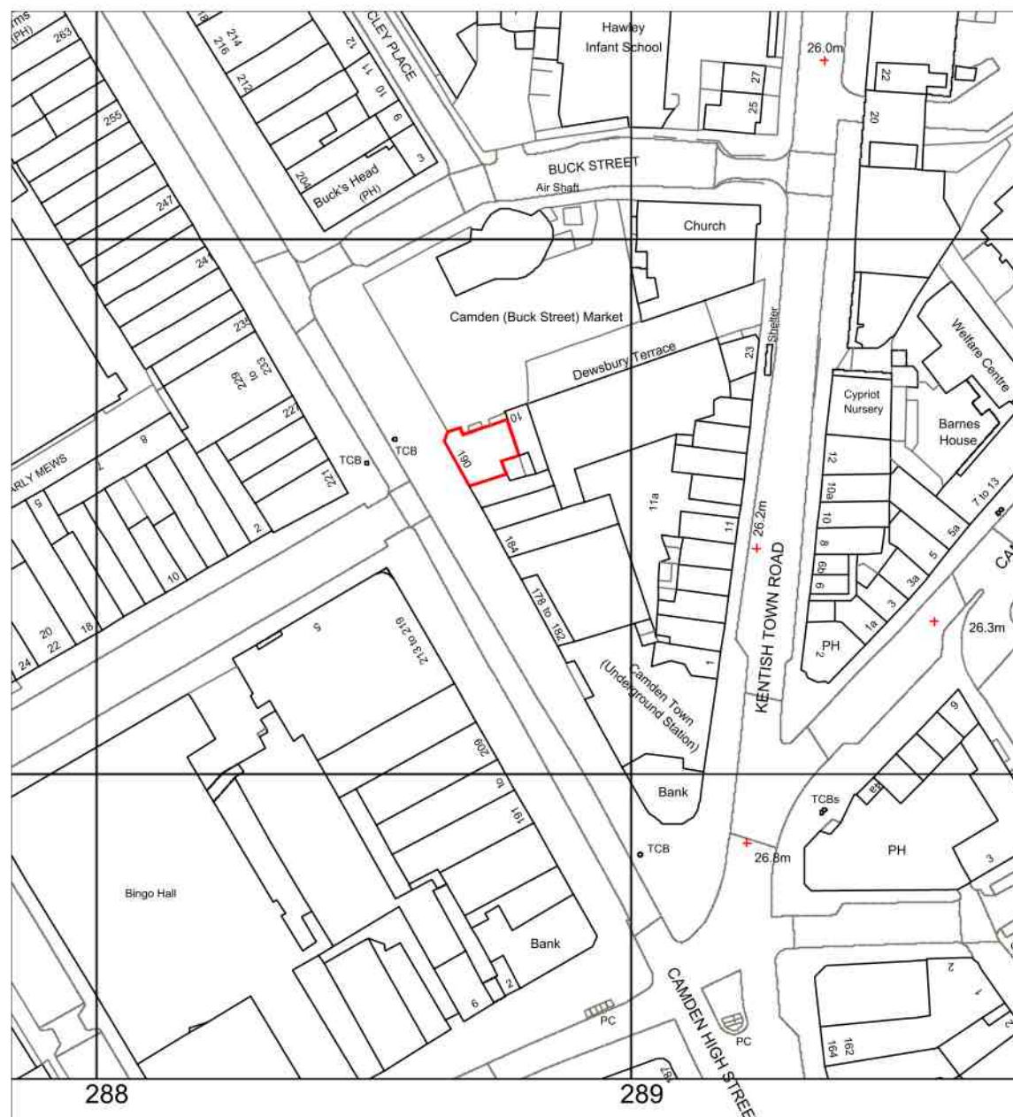
LOCATION PLAN - SCALE 1:1250 @A1