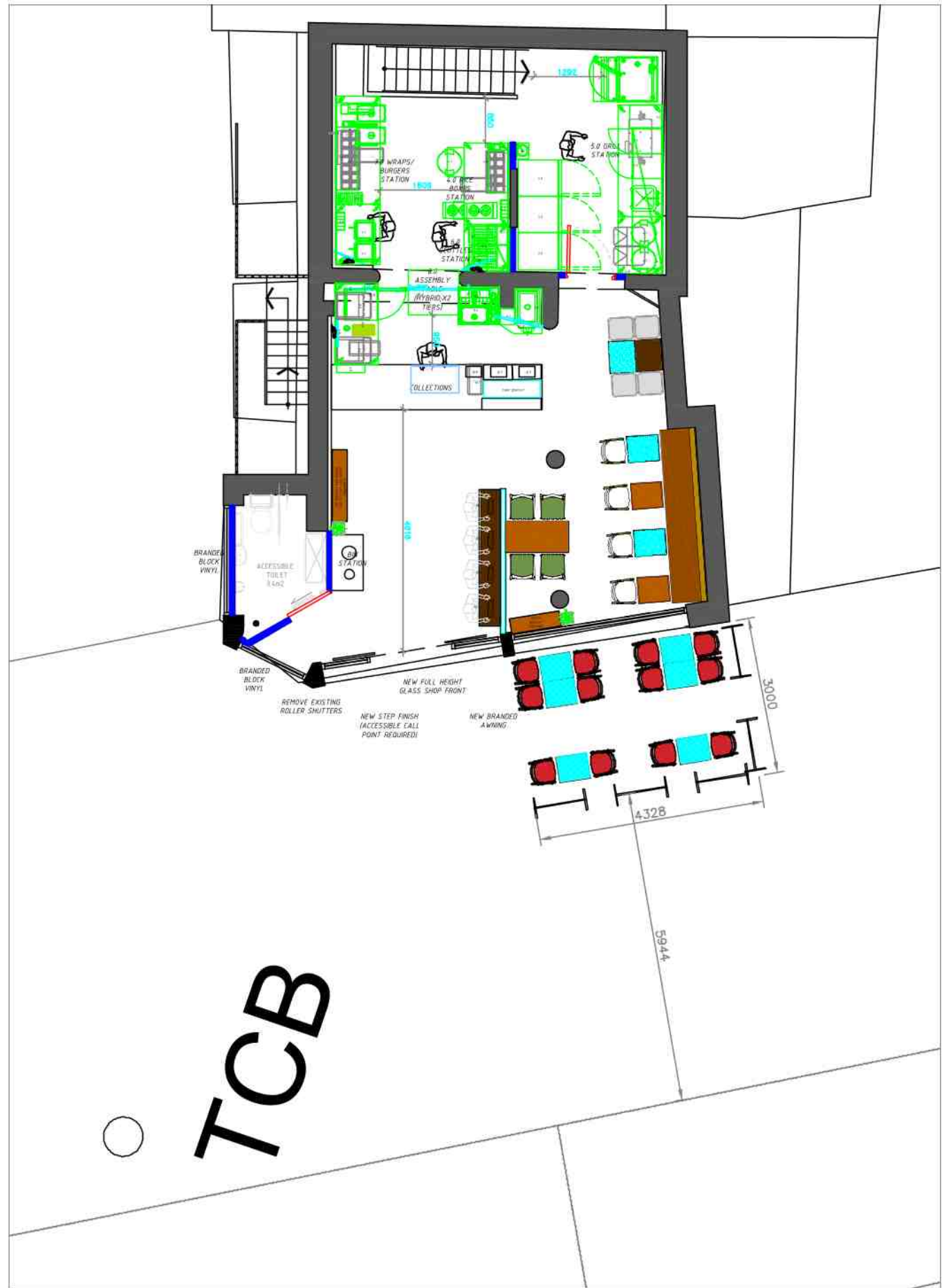
PROPOSED GENERAL ARRANGEMENT GROUND FLOOR