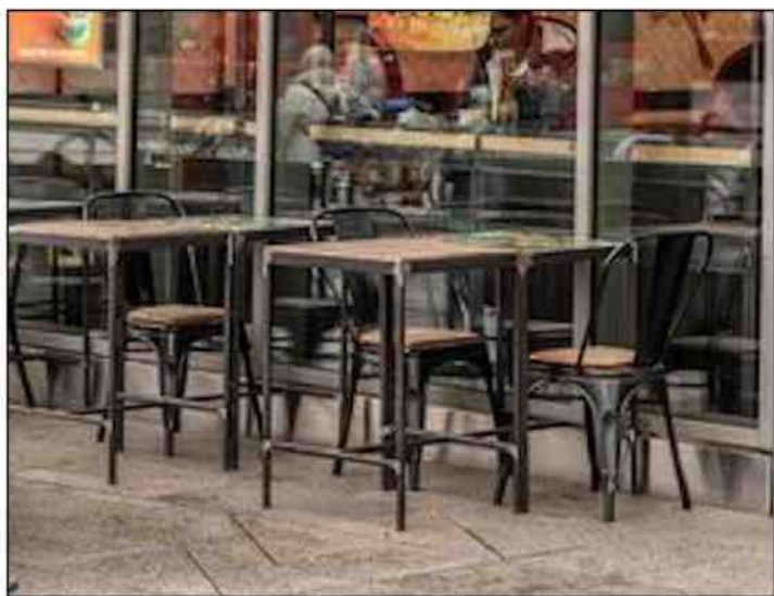
EXTERNAL SEATING REFERENCE IMAGE