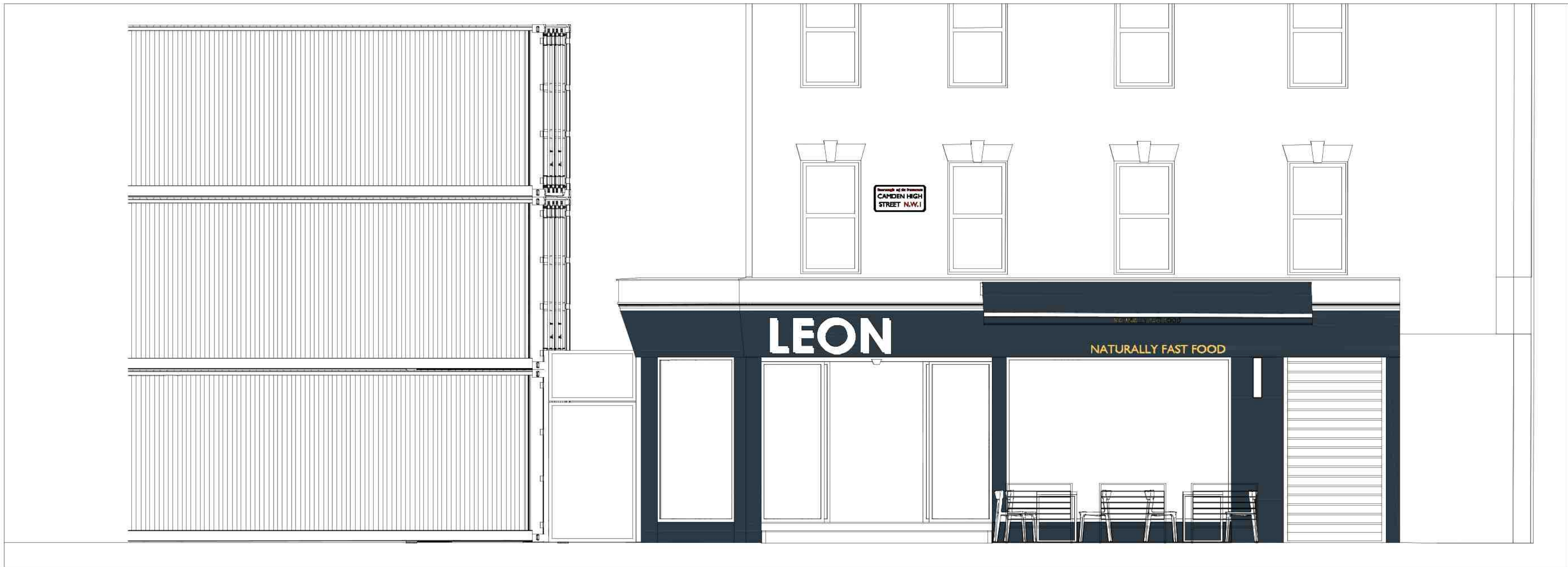
PROPOSED SHOP FRONT ELEVATIONS - SCALE 1:50