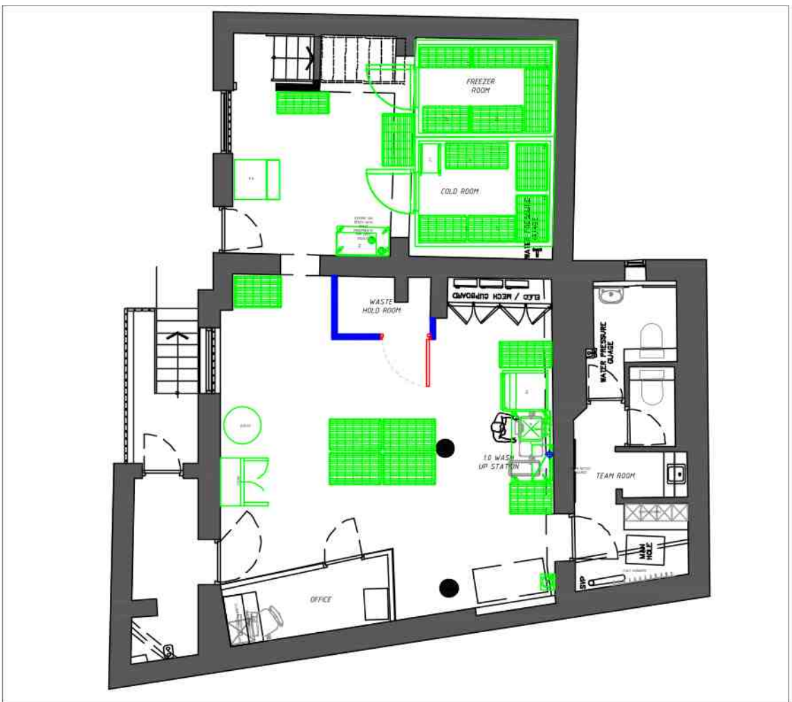
PROPOSED GENERAL ARRANGEMENT BASEMENT - SCALE 1:100