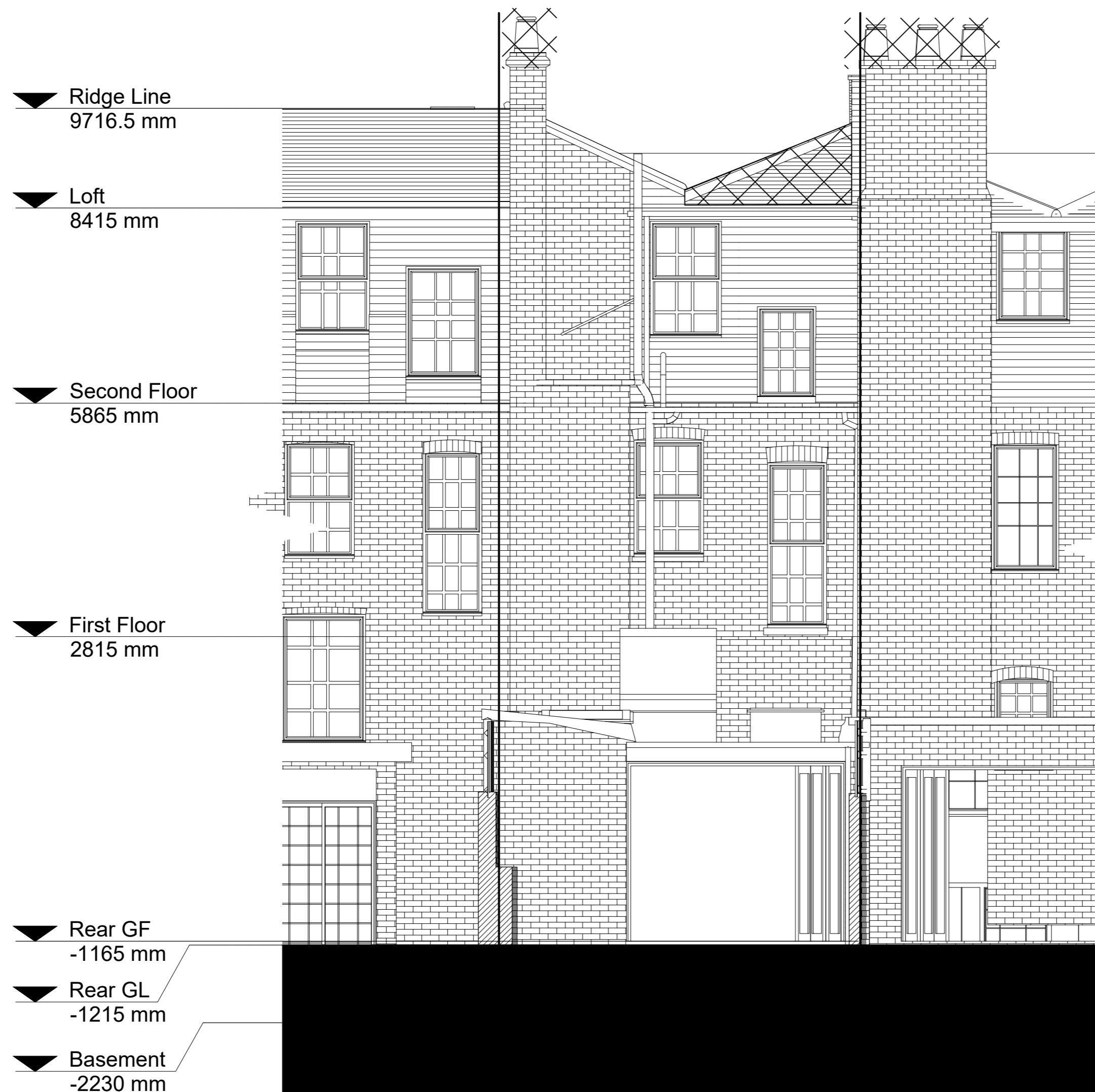
⊘ EXISTING REAR ELEVATION - Demolition indicated with a hatch SCALE: 1:50