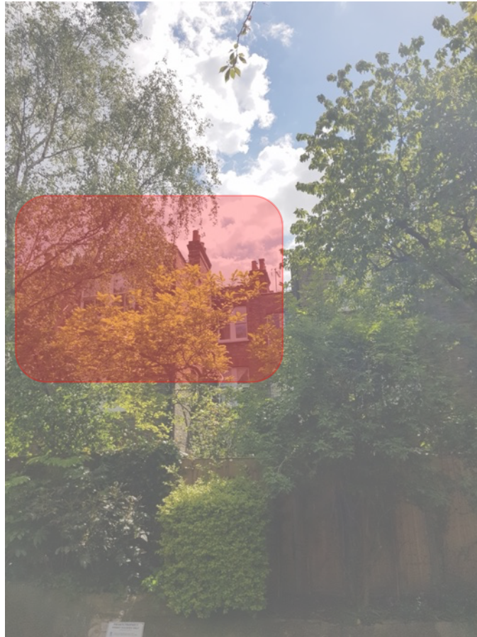
Photo 4: View from Tudor Close towards North West (taken 19 th May 2021)