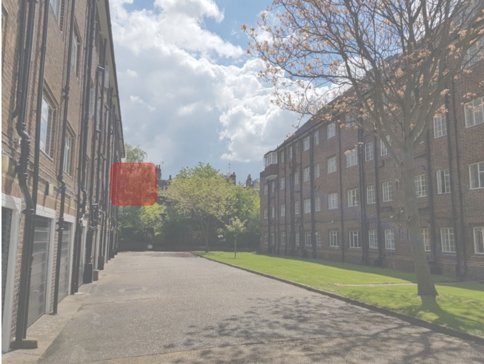
Photo 3: View from Tudor Close towards North West (taken 19 th May 2021)