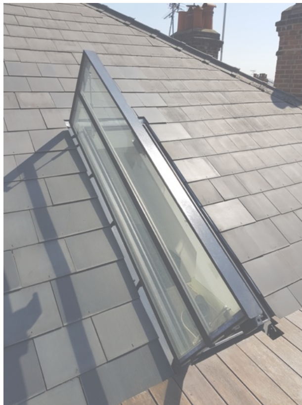
Photo 6: Access to Existing Roof Terrace via Existing Rooflight (taken 19 th April 2021)