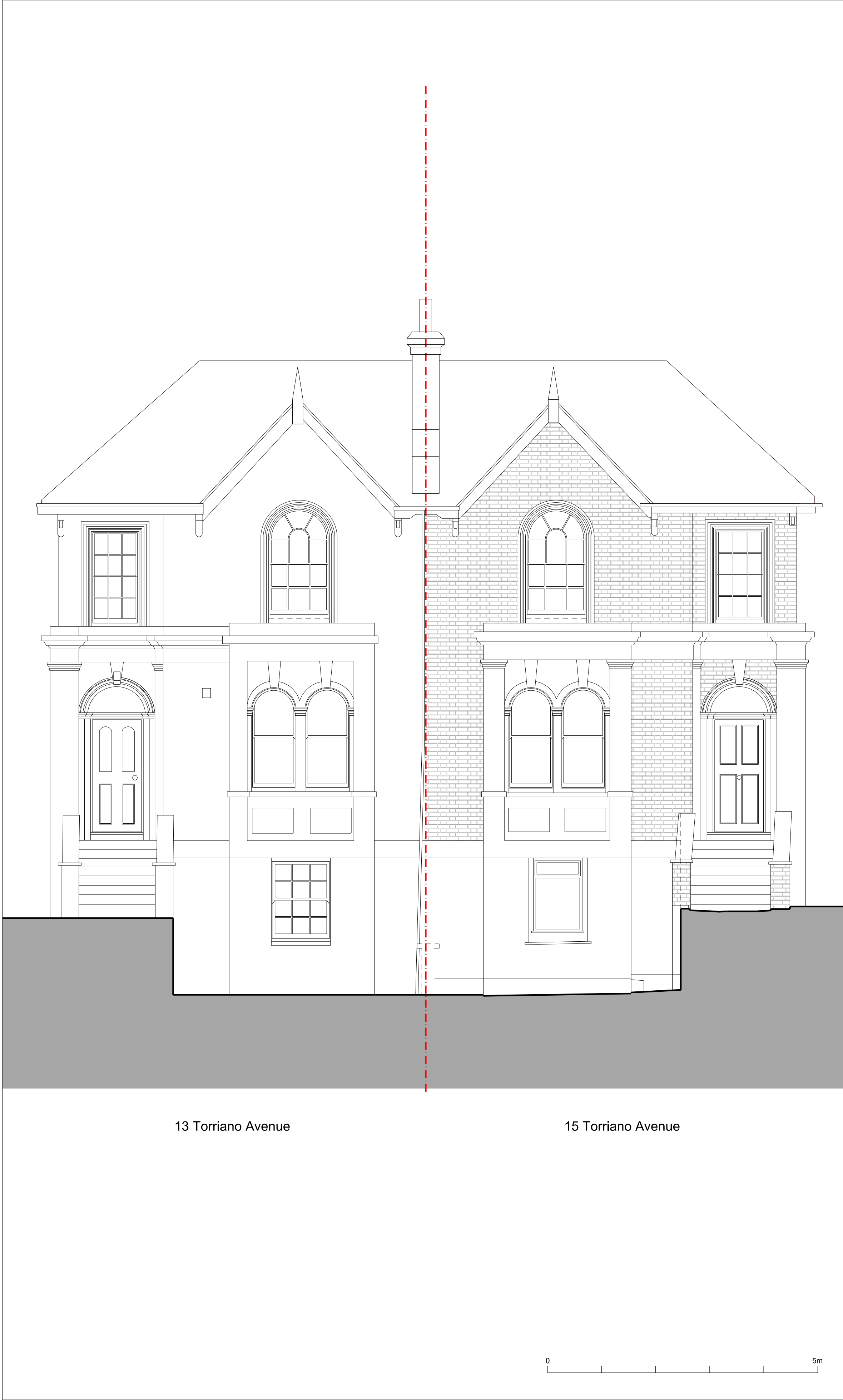
01 Existing Elevation A 1:50 @ A1