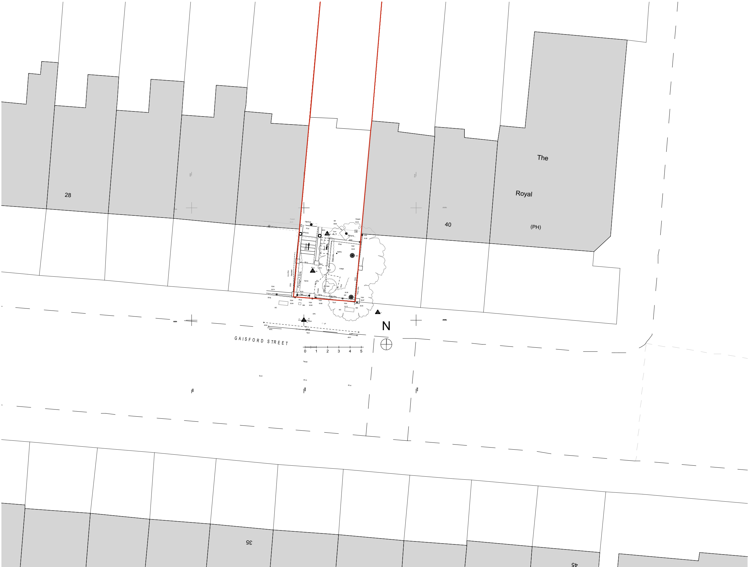
Site Plan - Existing 1:200