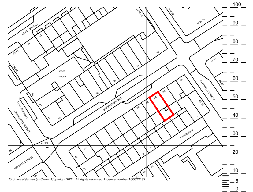
LOCATION PLAN - 1:1250