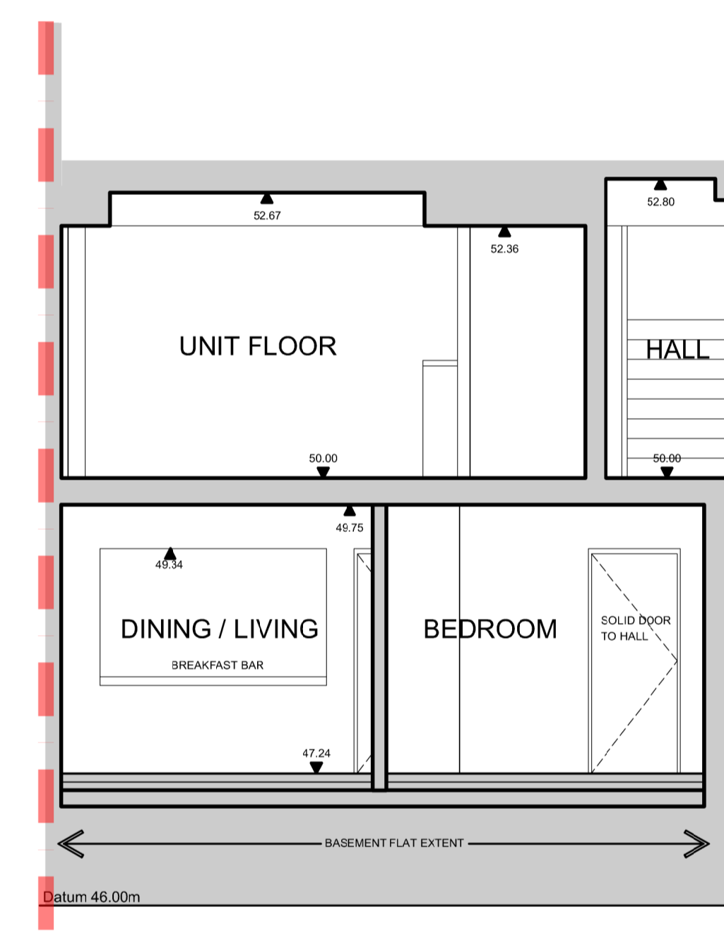
2 PROPOSED SECTION B