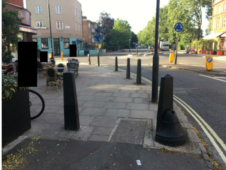
Photo 1, looking south on Highgate West Hill. Lamppost omitted, bollards not in position drawn