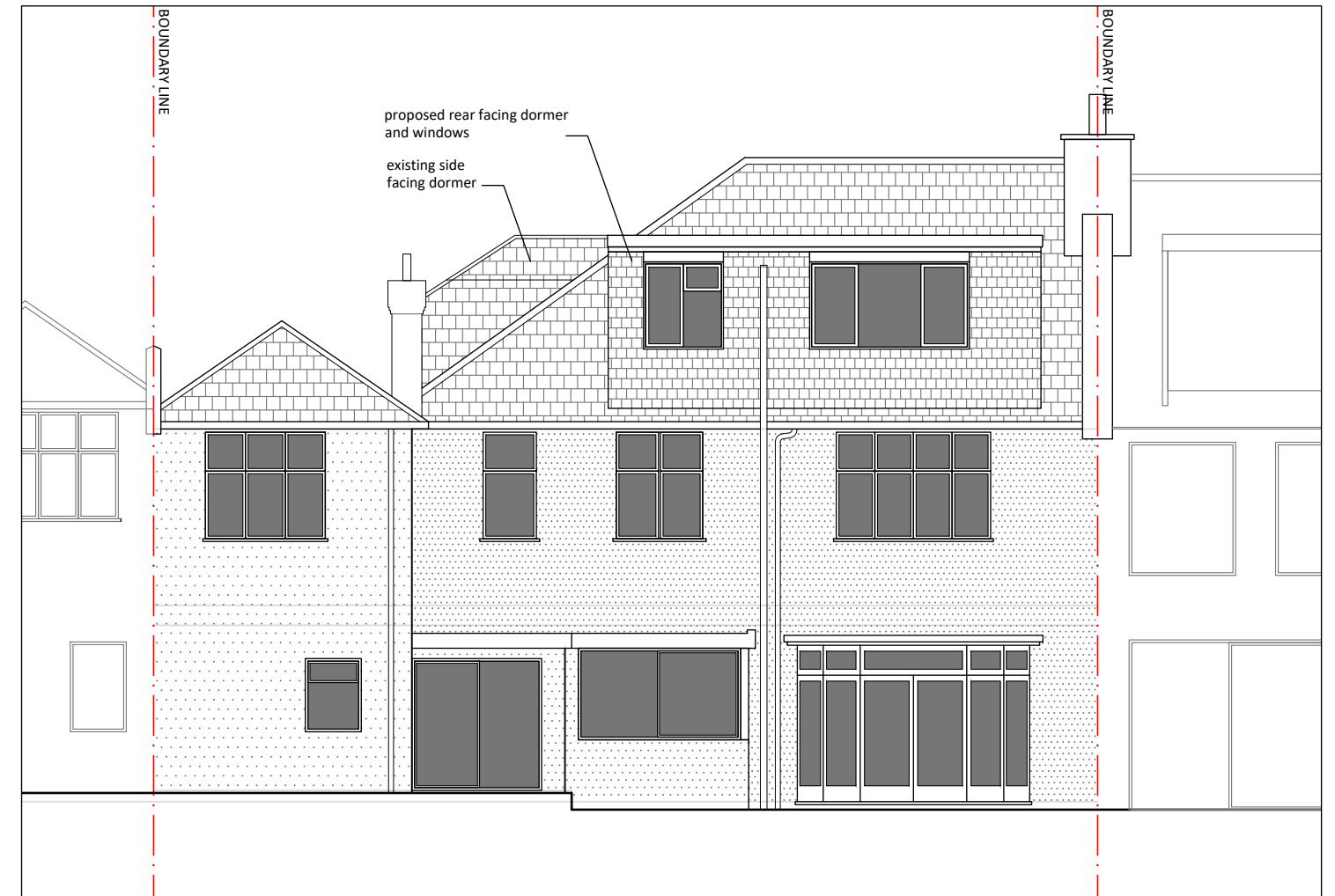
PROPOSED REAR ELEVATION (NORTH EAST) SCALE 1:100 @ A3