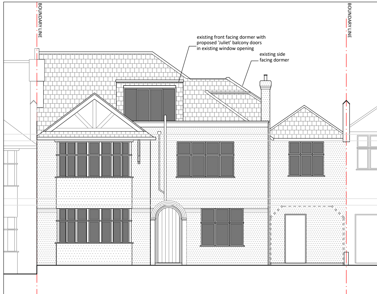
PROPOSED FRONT ELEVATION (SOUTH WEST) SCALE 1:100 @ A3