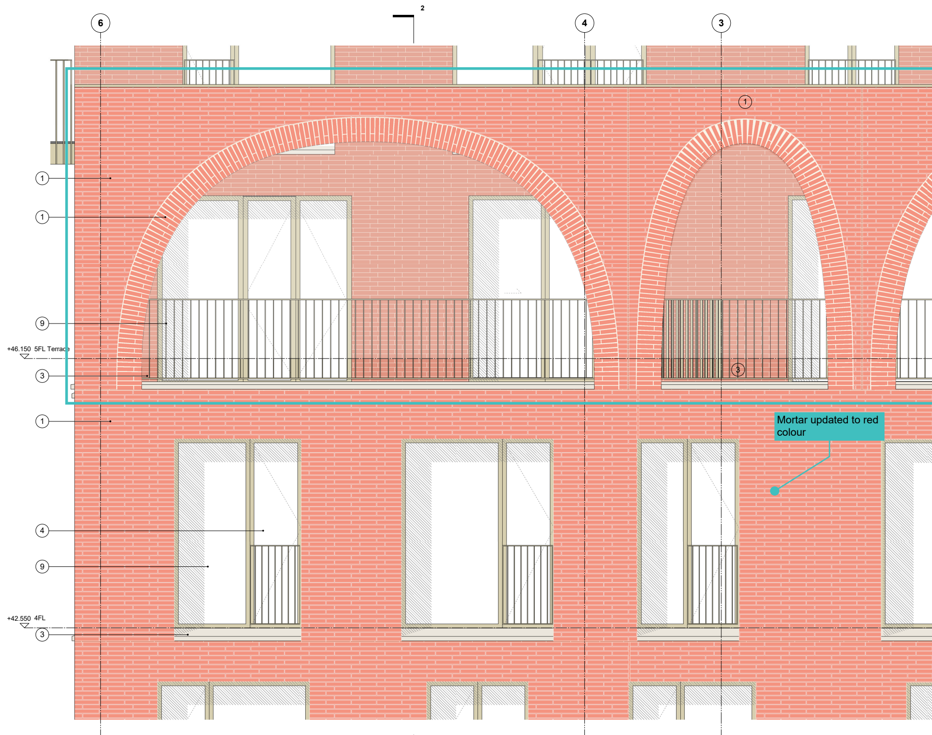
1 ELEVATION DETAIL WEST CORE 5TH FLOOR