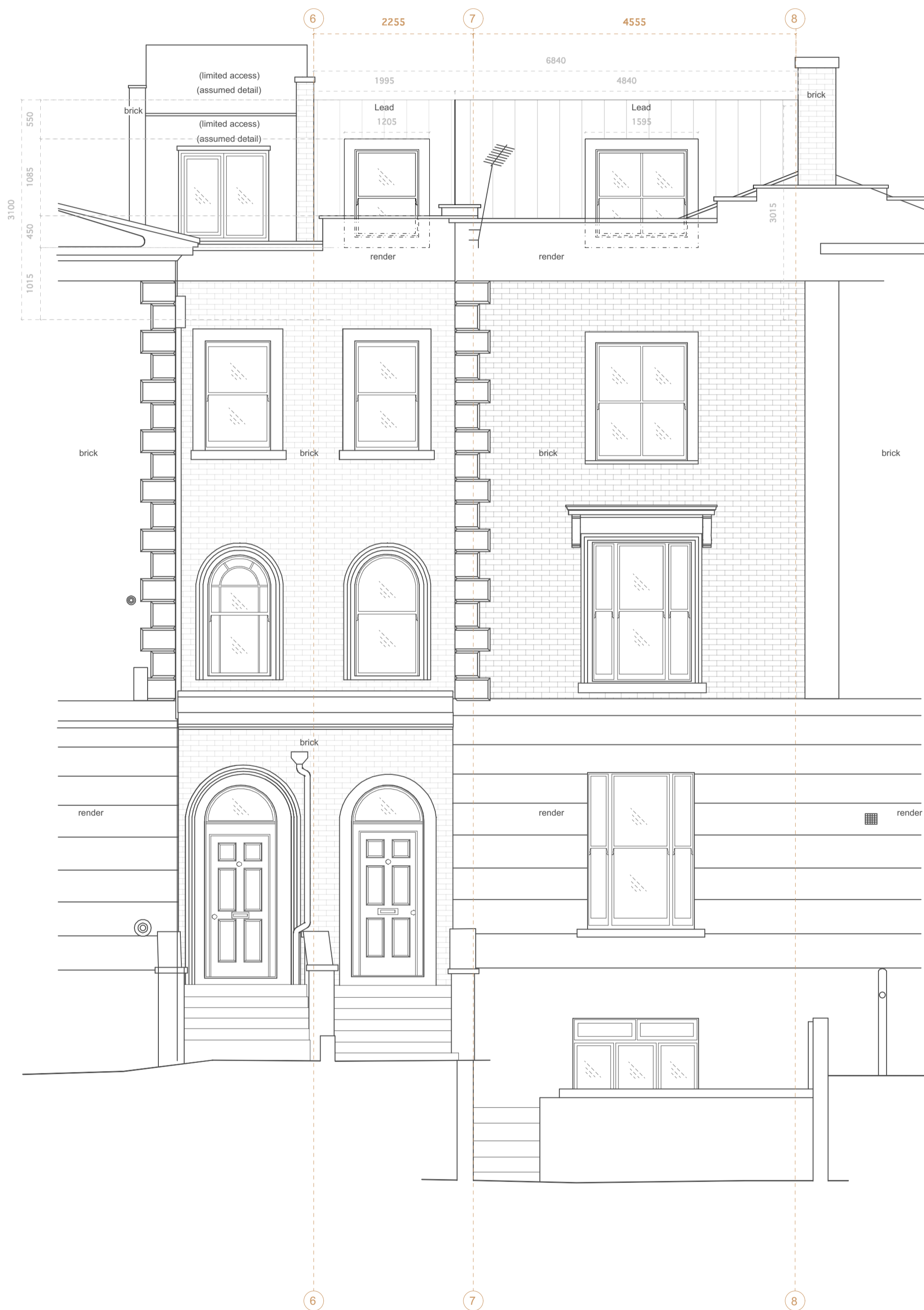
01 PROPOSED ELEVATION FRONT 1:50 @ A1, 1:100 @ A3