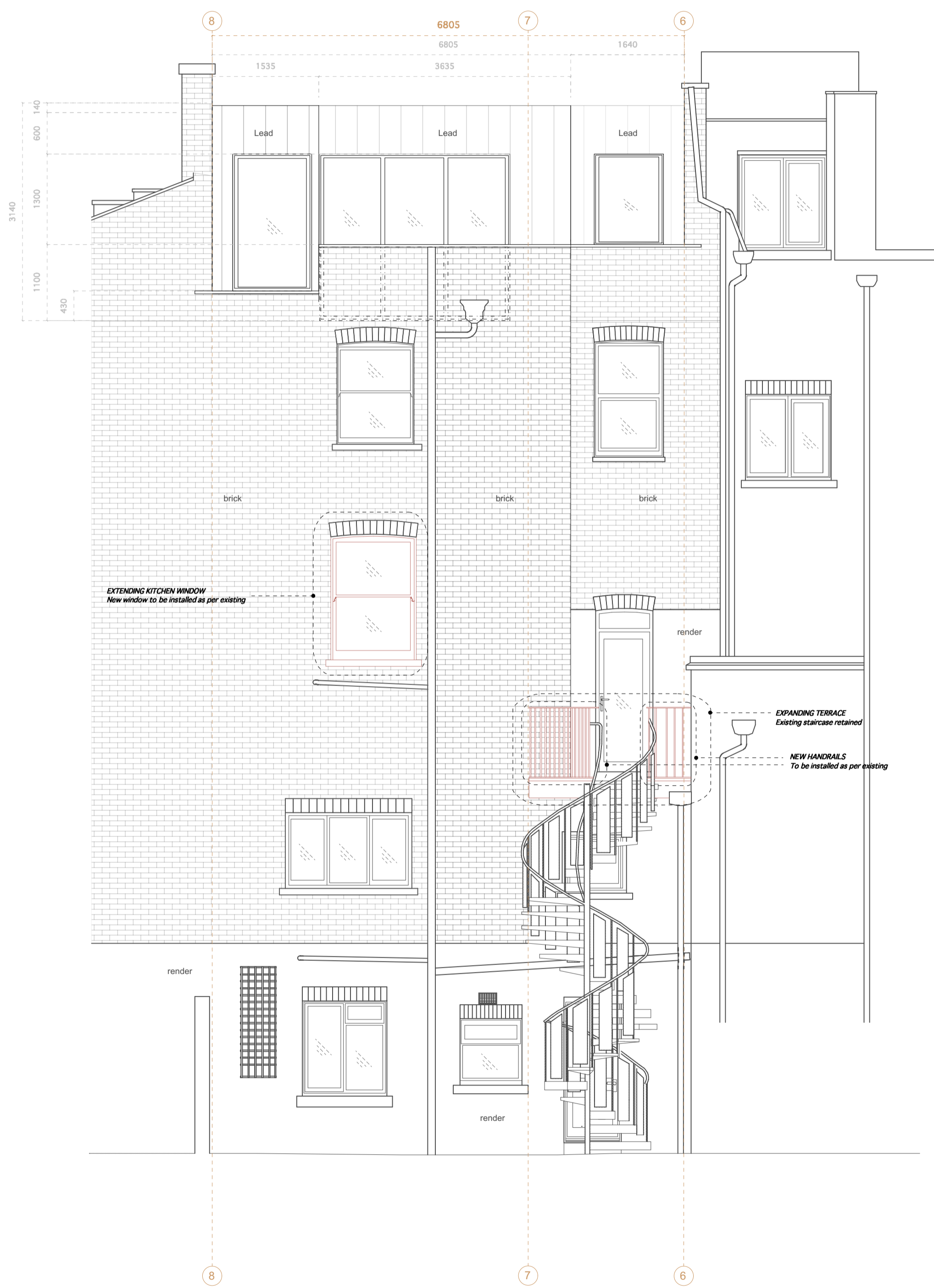
01 PROPOSED ELEVATION REAR 1:50 @ A1, 1:100 @ A3