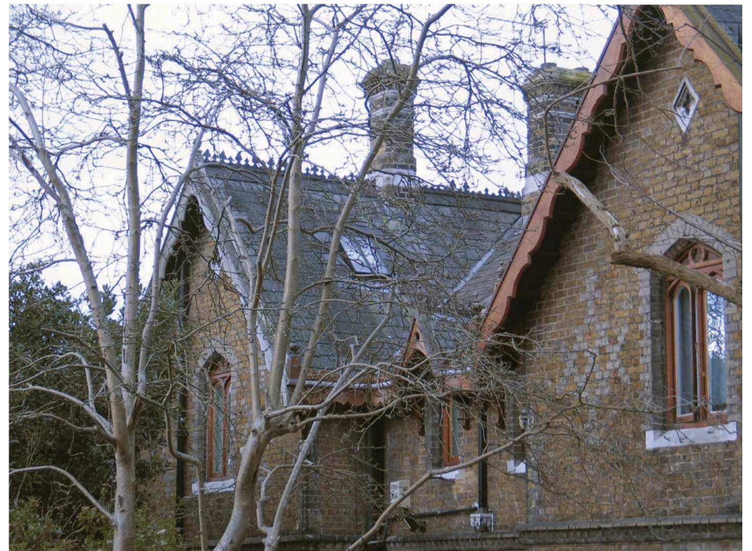
Above: Conservation rooflight to no.9 Holly Village