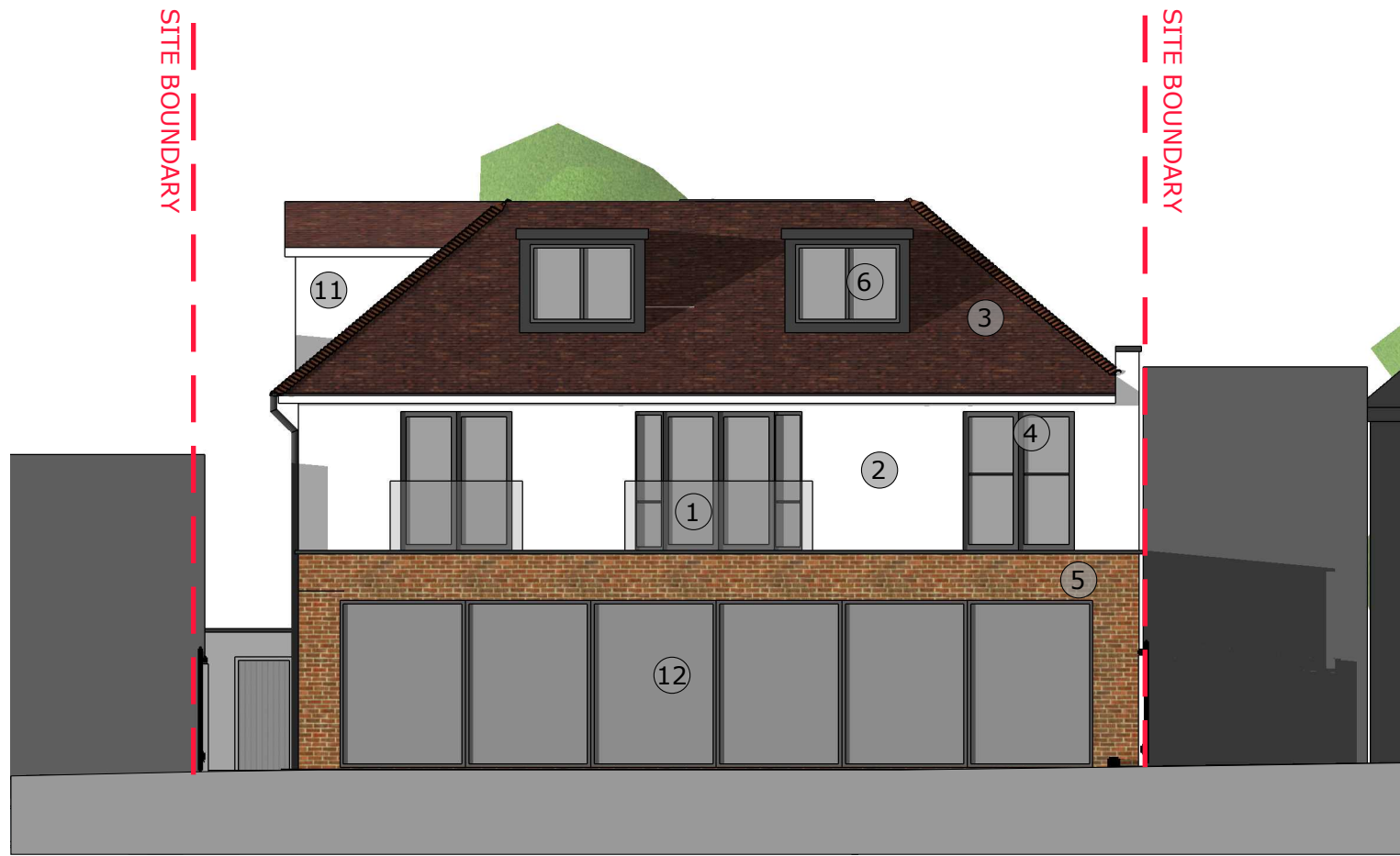
[01] PROPOSED REAR ELEVATION (north east)