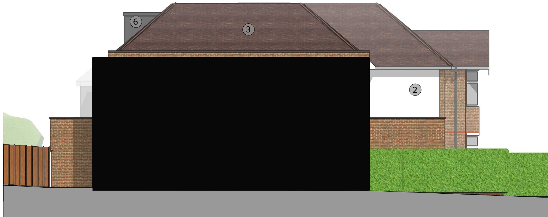
[02] PROPOSED SIDE ELEVATION 2 (north west)