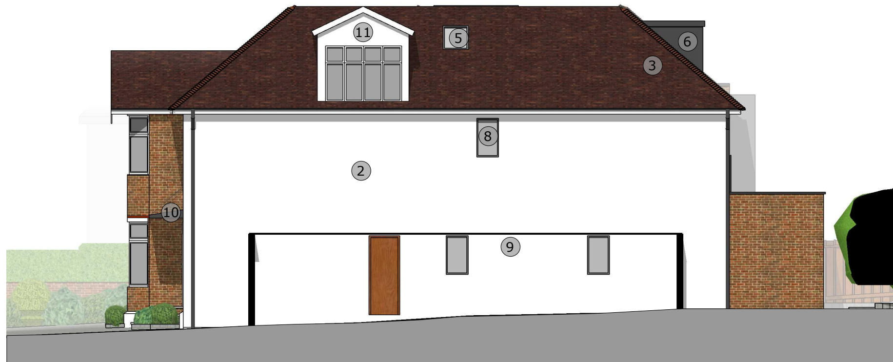
[02] PROPOSED SIDE ELEVATION 1 (south east)