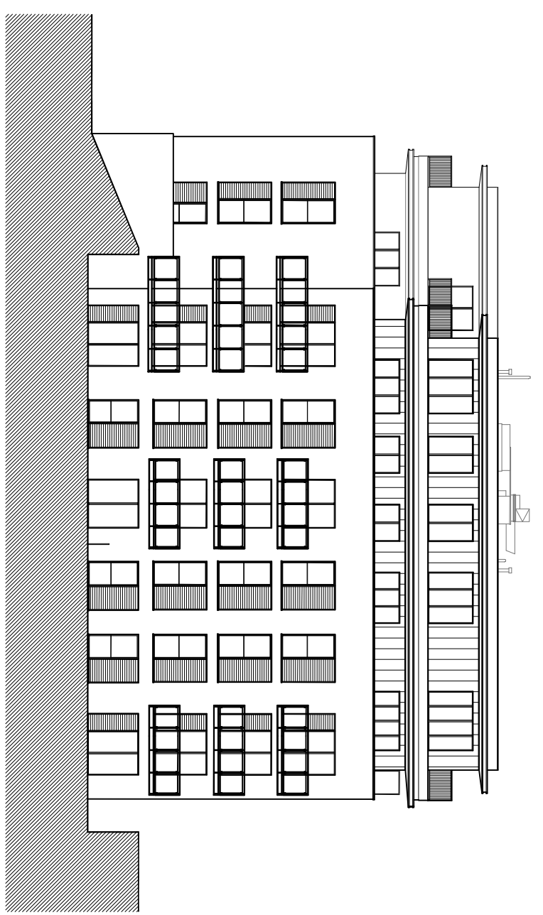
Proposed Side Elevation (East) 1:250 @ A3