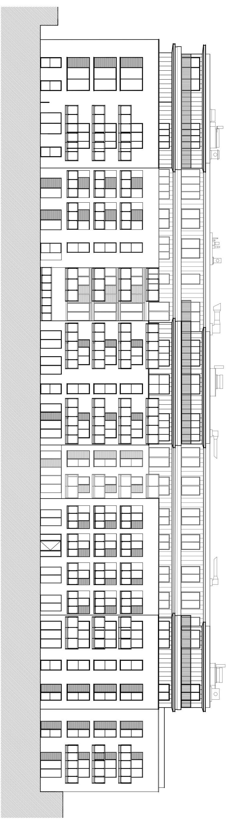
Proposed Rear Elevation (North) 1:250 @ A3