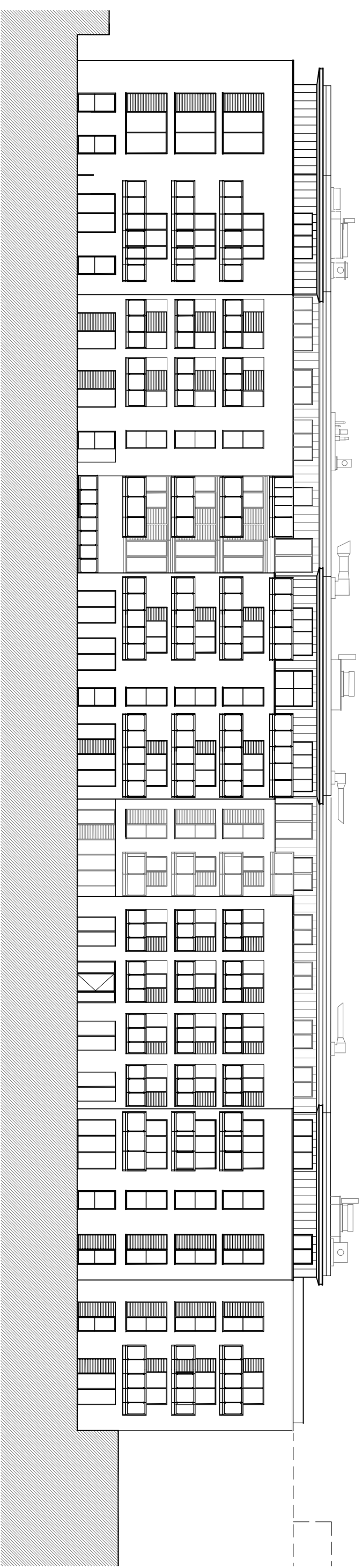
Existing Rear Elevation (North) 1:250 @ A3