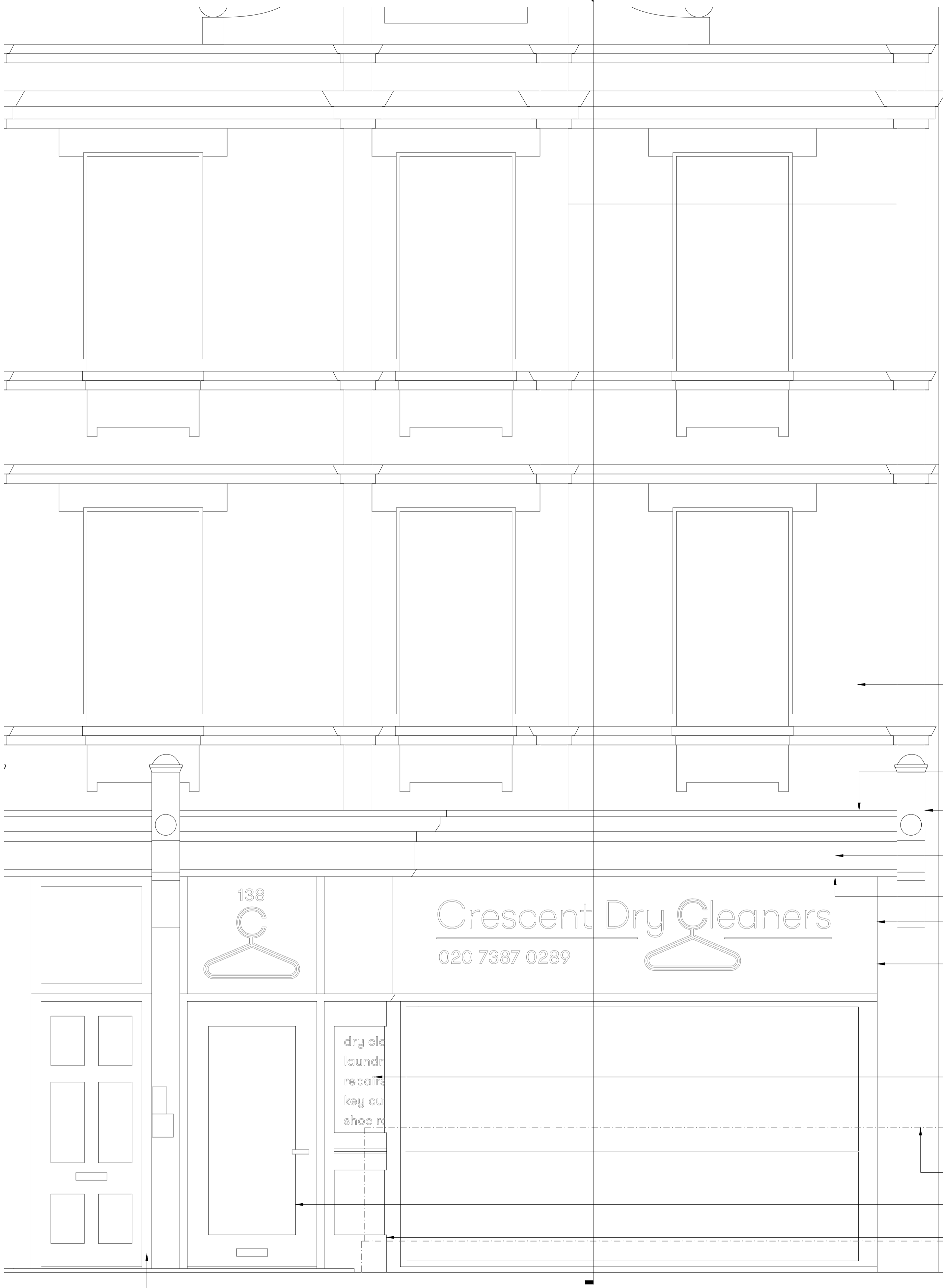
01 Proposed Elevation