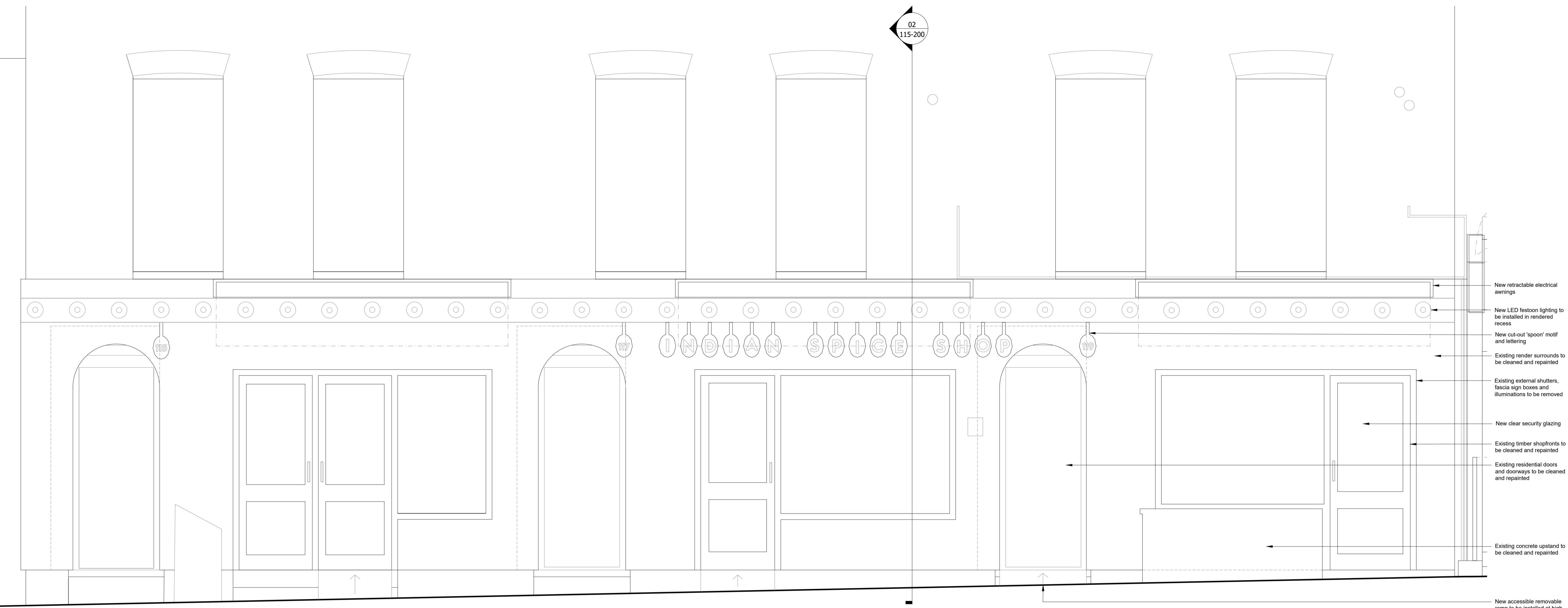
01 Proposed elevation