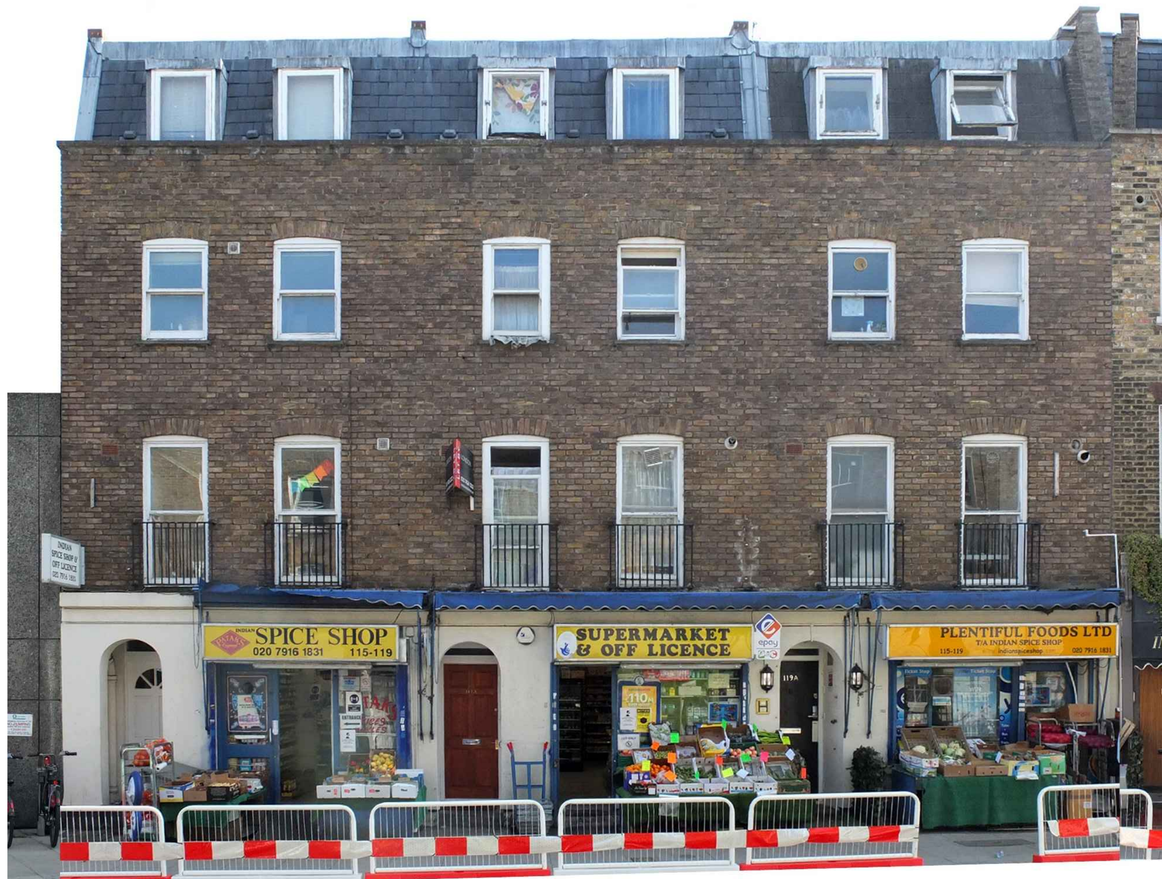
02 Existing Photo Elevation