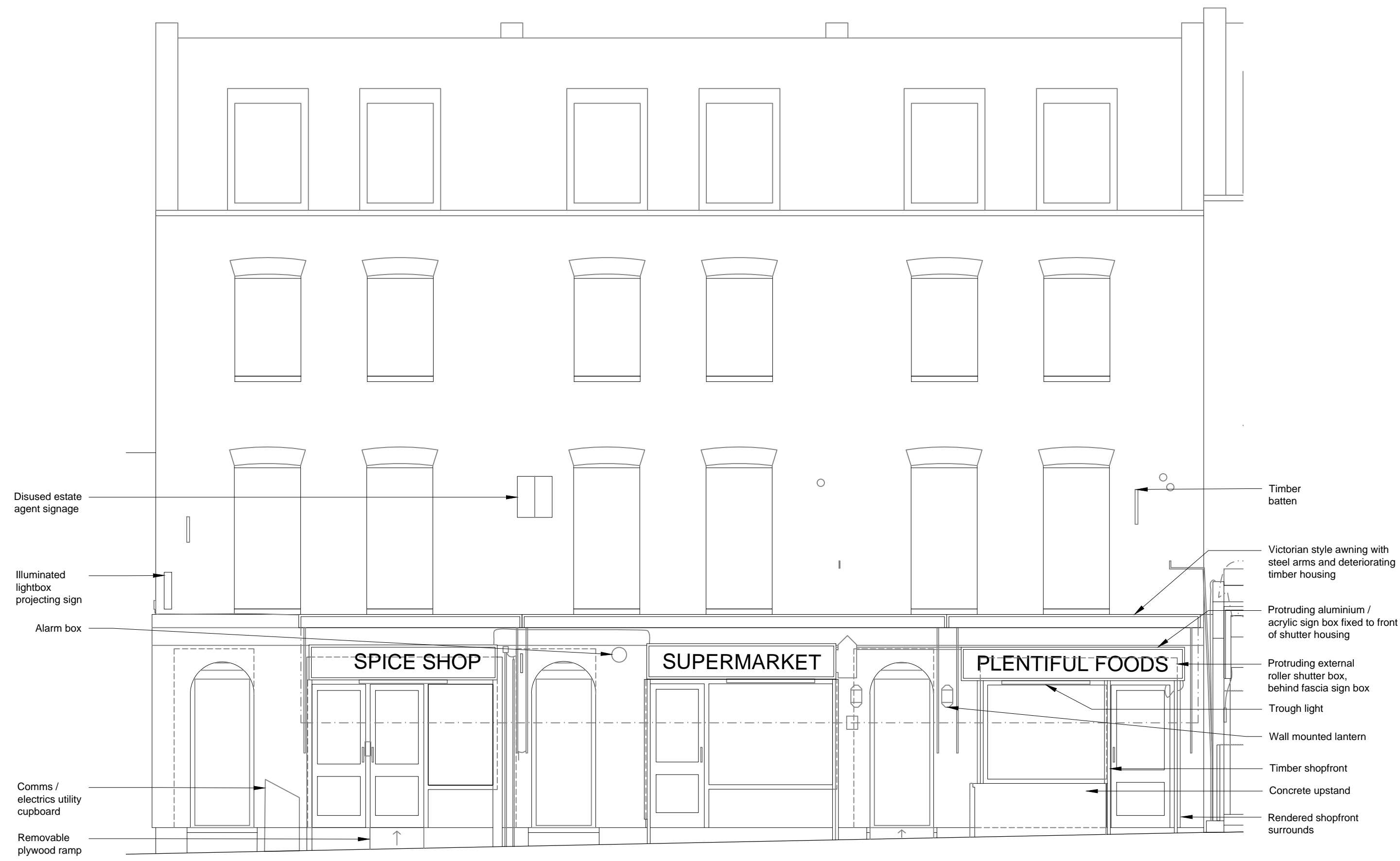
01 Existing Elevation