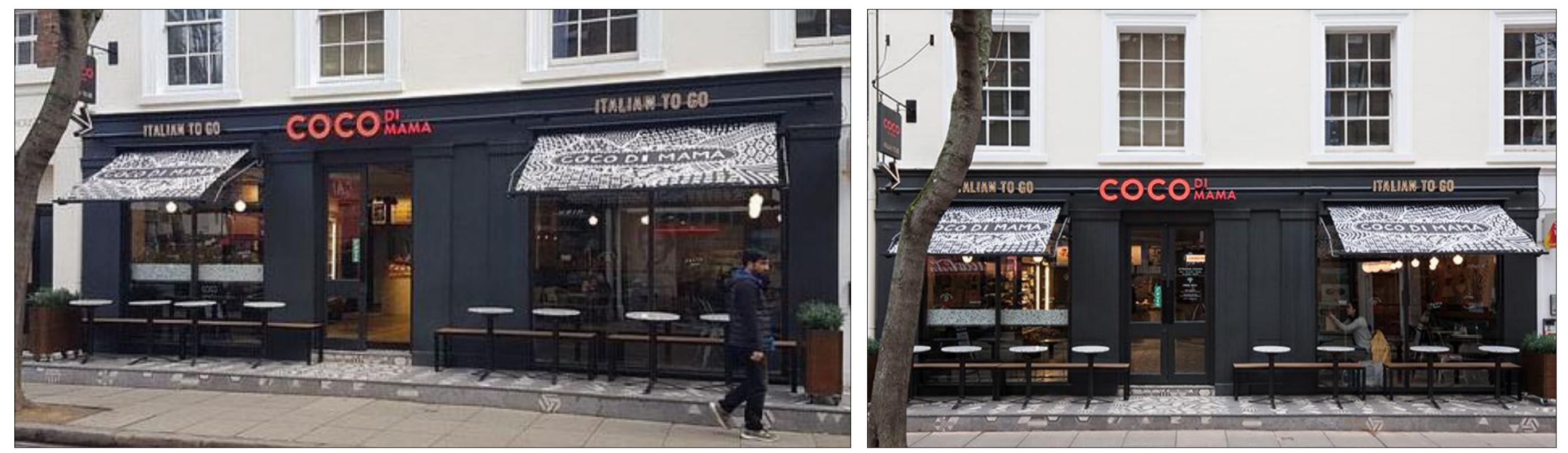
07 EXISTING SHOPFRONT PHOTOS