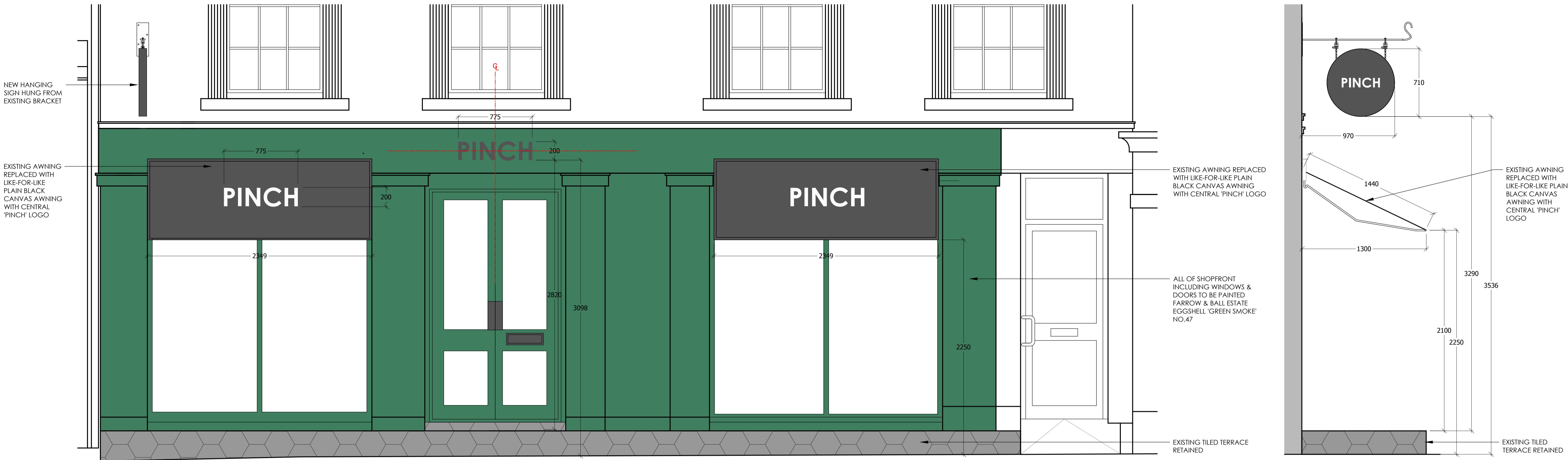
01 SHOPFRONT ELEVATION Scale: 1:20 @ A1