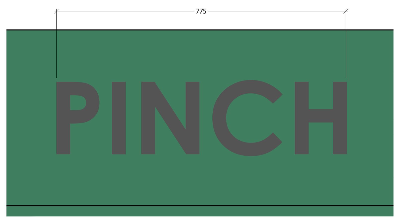
05 FASCIA SIGN ELEVATION Scale: 1:5 @ A1