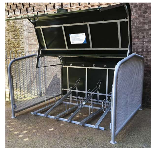
Reference images for FalcoPod Hangars