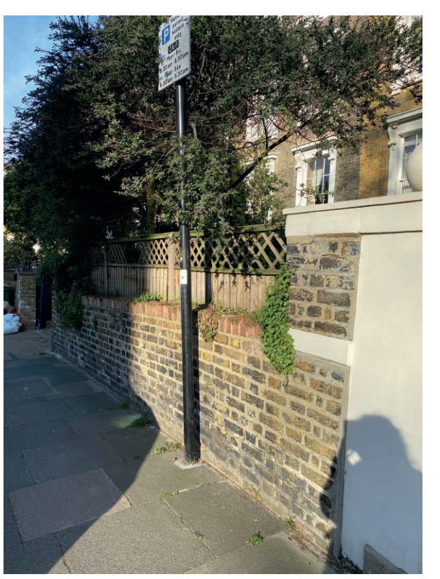
5. No. 6 Gloucester Crescent front wall detail