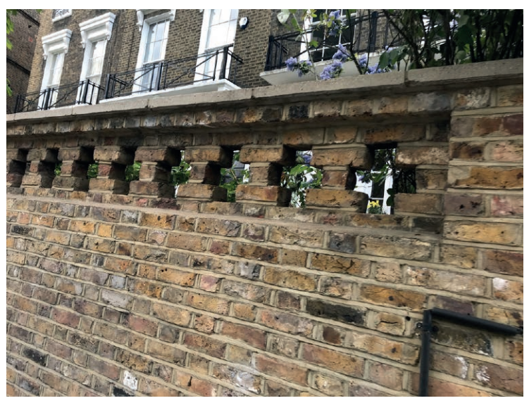
7. 27 Gloucester Crescent front wall detail