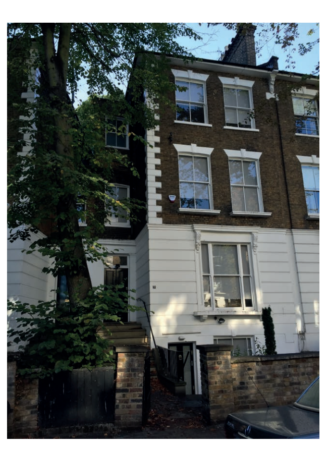
1. No. 57 Gloucester Crescent front view