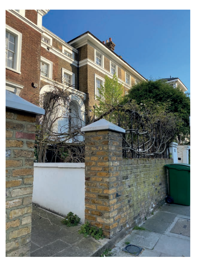
6. No. 9 Gloucester Crescent front wall detail