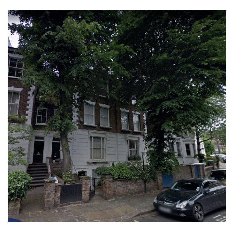
3. No. 57 Gloucester Crescent front view