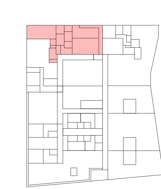
477 St Pancras Commercial Centre