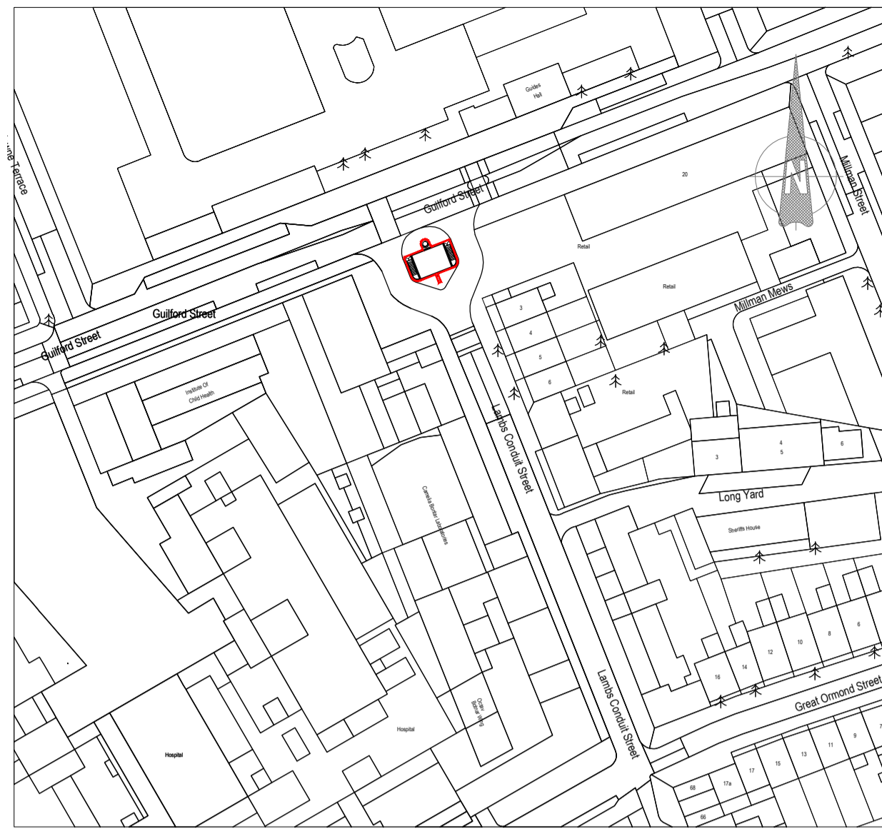
4 Location Plan Scale: 1:1250 0 1 5 10 50 100 Scale: (m)