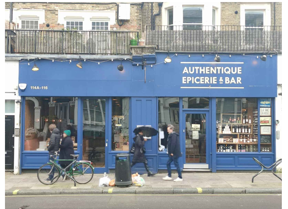
EXISTING STREET VIEW