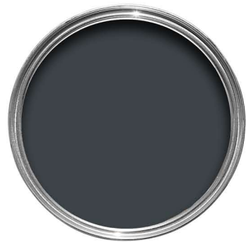
Entrance Door Farrow & Ball 'Railings' Paint